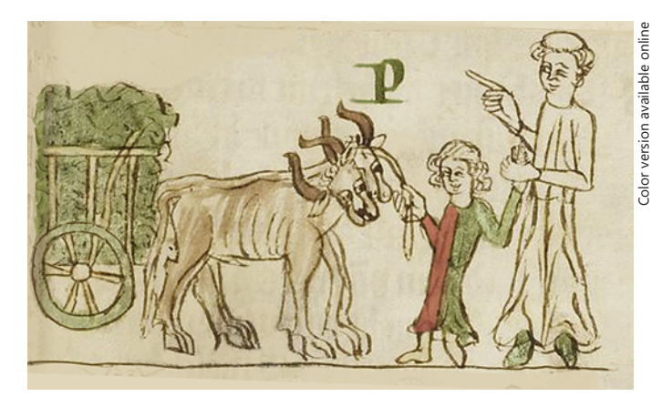
Fig. 2. Sachsenspiegel, ca. 1234 CE: Article 45 §9: the red-green garment identifies the "dishonest" birth, the letter p the parson's child. See text for details [24].

In most civil laws, "bastards" could not inherit. But in German-speaking states, the birth certificate separated them from middle class and prosperity. The Reformation brought forth a pharisaic and priggish religiosity, and the tolerance towards extramarital sexuality vanished. The Free Imperial City of Frankfurt closed its municipal brothels and turned prostitution into a crime in 1574. From 1562 to 1696, the same city pronounced more verdicts for sexual infringements ("fornication," adultery, incest) than for violent crimes [21]. Medieval trade and manufacturing were under the control of the guilds,