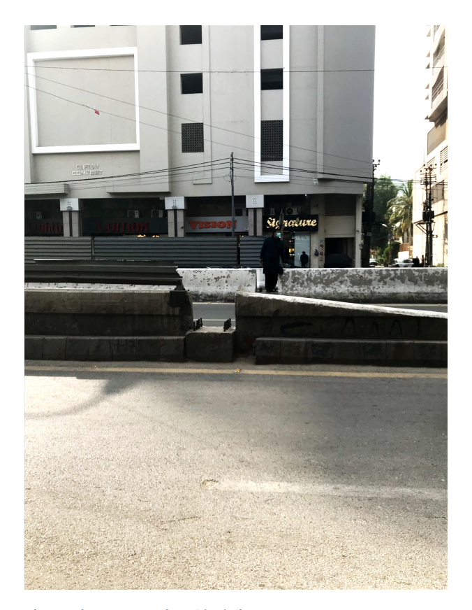
Figure 4. Walking pathways through gaps at the Gizri flyover.