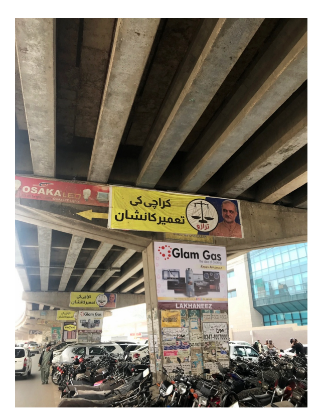
Figure 7. "The symbol of Karachi's built progress," reads a Jamaat-e-Islami poster amidst a throng of parked motorcycles and cars.