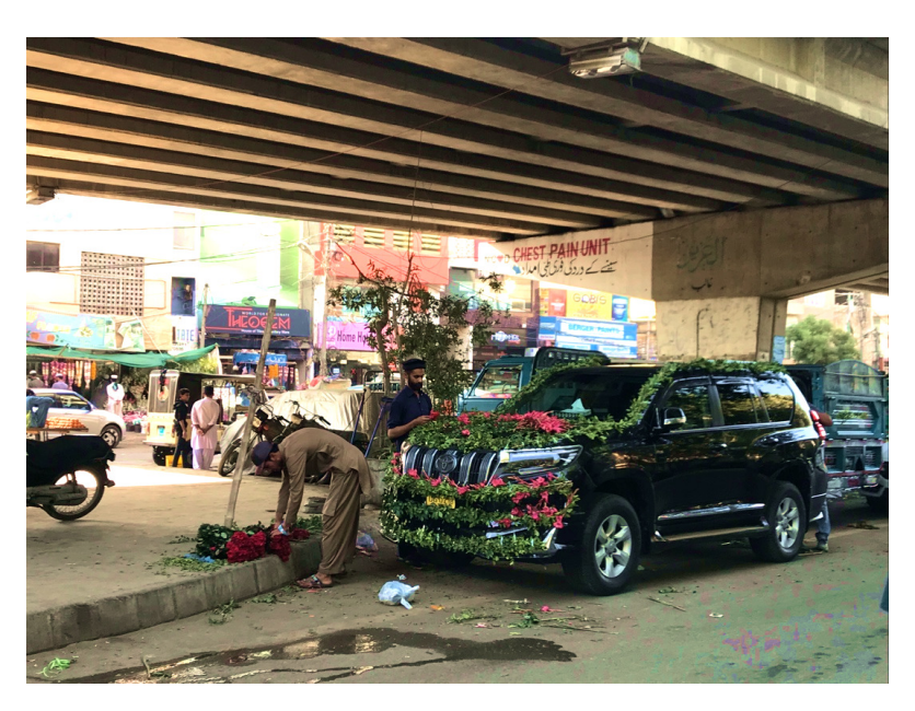
Figure 8. Floral embellishments are added to a customer's car in preparation for a wedding.

In the teeming, crowded, and diverse scenes under the flyover, such forms of producing visibility were habituated by the market itself and the people who passed through it. All actors and their activities under the flyover faced the road, in clear view of the shopkeepers and those driving by in cars and motorcycles. Shopkeepers sometimes relied on the workers for small jobs and fixes. Majed, for example, often did repair work for the shopkeeper of a high-end brand of stoves in the market. Staying visible in that shopkeeper's view was an everyday strategy. Knitted in these relationships, therefore, is the role that visibility plays in entreating livelihood in the interstice.