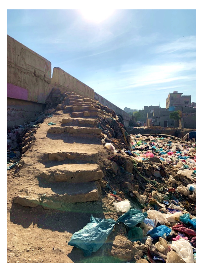
Figure 5. Stairs leading to Lyari Expressway.