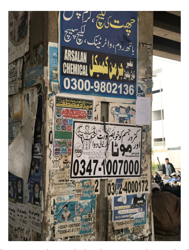
Figure 6. Flyover columns feature many layers of advertisements, notices, and political posters.