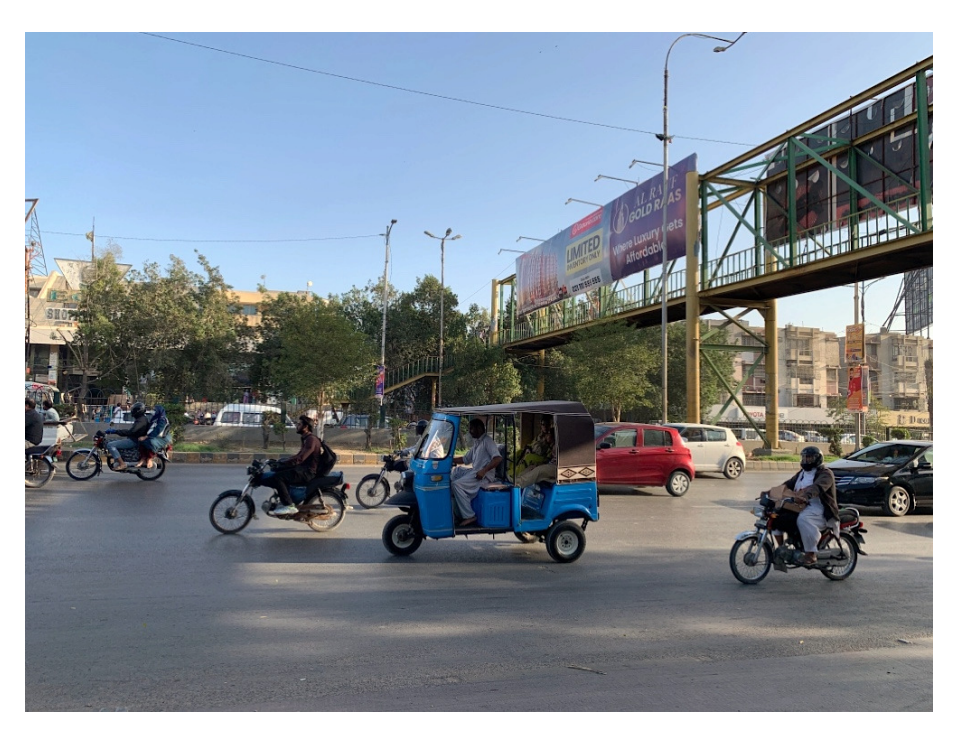
Figure 3. Pedestrian bridge at Shah-rae-Faisal Road.