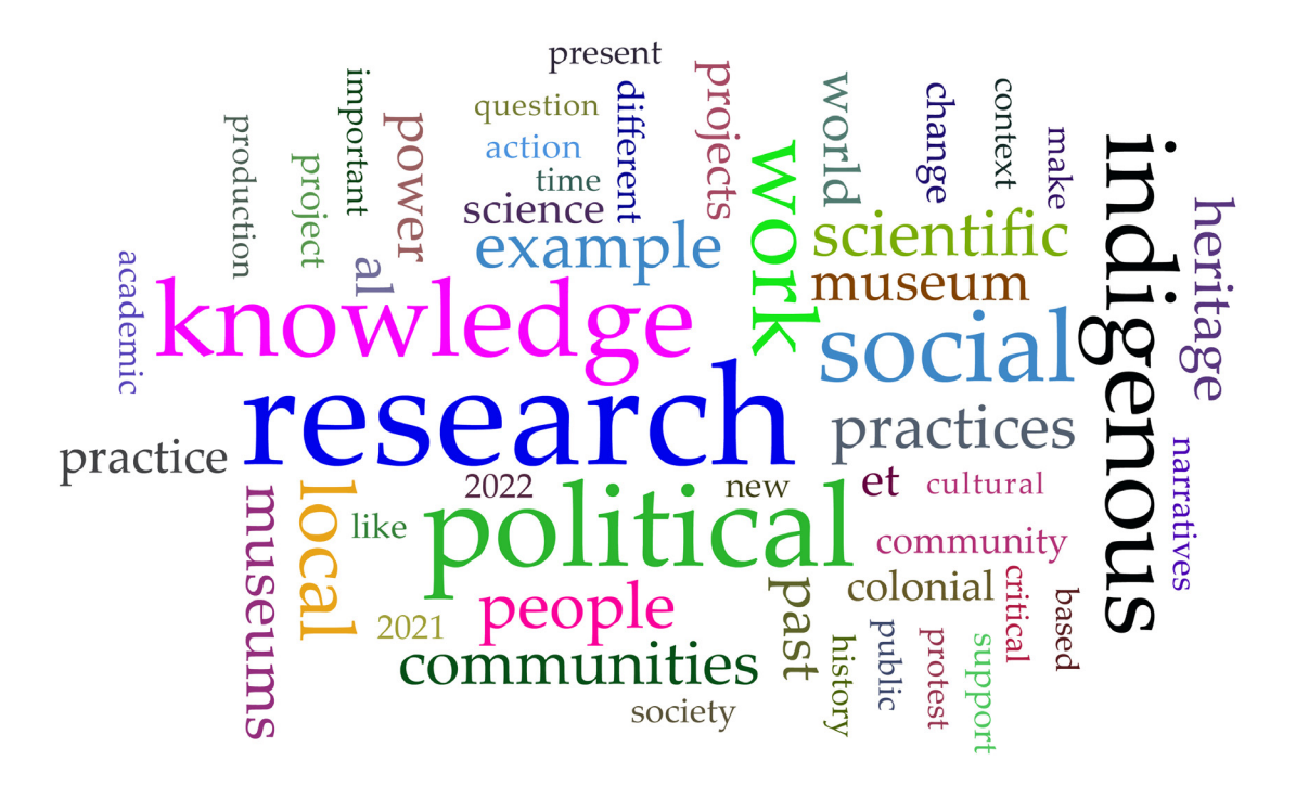
Fig. 1. Text analysis of Archaeology as Empowerment theme issue with words like 'archaeology/ist' and 'activist/ism' excluded. Most common words: 'research' (175); 'political' (140); 'social' (110); 'knowledge' (108); 'Indigenous' (102). Generated by Voyant.

Fig. 1 is a basic text analysis of the volume's content and reveals that we are still very much research-focused while being aware of political threats and Indigenous possibilities and guidance. 'Communities' (65 mentions), 'heritage' (64) and 'museums' (60) also show a turn toward archaeology-as-heritage and community facing (sometimes as yet an ideal rather than a reality).