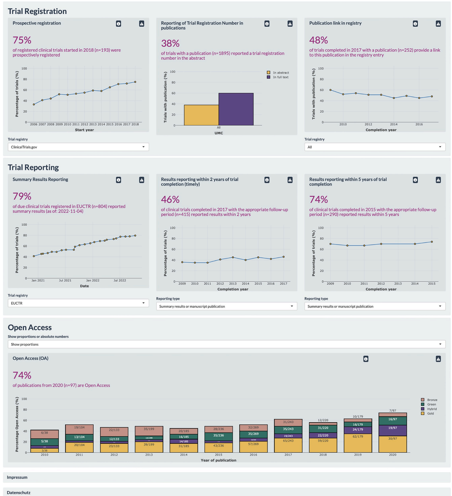
Fig 3. Screenshot of the home (“Start”) page of the dashboard for clinical trial transparency. Assessment of 7 registration and reporting practices across all included German UMCs (8 November 2022).

https://doi.org/10.1371/journal.pmed.1004175.g003