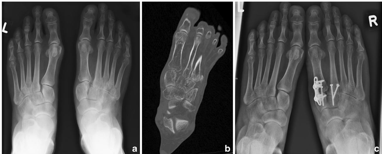
Fig. 2 Case of a 49-year-old female patient who was diagnosed a Lisfranc injury of the right foot after a fall from stairs. Conservative treatment was initiated in an external hospital. 5 months later, she visited our clinic with persistent pain. a The pre-operative x-ray showed a secondary displacement of the C1-M2 junction; the computer

In group B-1, reduction of the dislocated joint line was performed in 52 cases (89.7%) in an open manner. Closed reduction and temporary K-wire fixation were done in six cases (10.3%). In group B-2, open reduction and internal fixation had to be done in all 20 patients (100%). Comparison of the radiologic results one week after the operation revealed that in group B-2, the Buehren B sign was higher