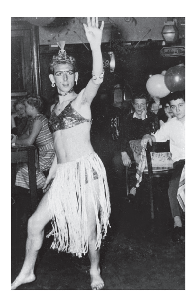
Figure 2.4. Boheme bar. Polizeihistorische Sammlung Berlin.