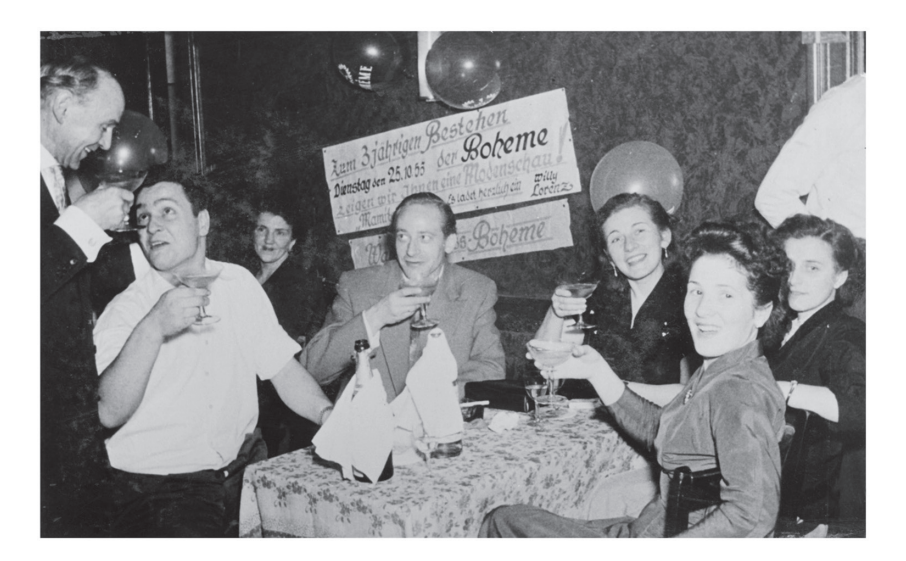
Figure 2.1. Boheme bar.