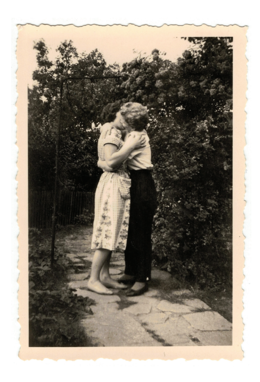
Figure 1.10. Passionate kisses under the roses.