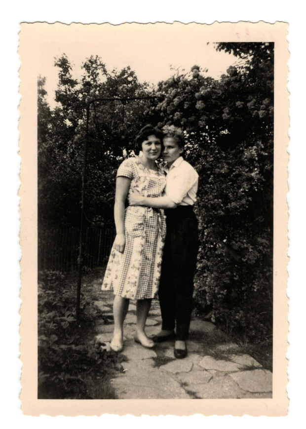
Figure 1.9. A young butch-fem couple in Tommy's garden.

what might be called a feminine masculinity, with pants that accentuate her hips and simple, but elegant slippers (figures 1.9 and 1.10).