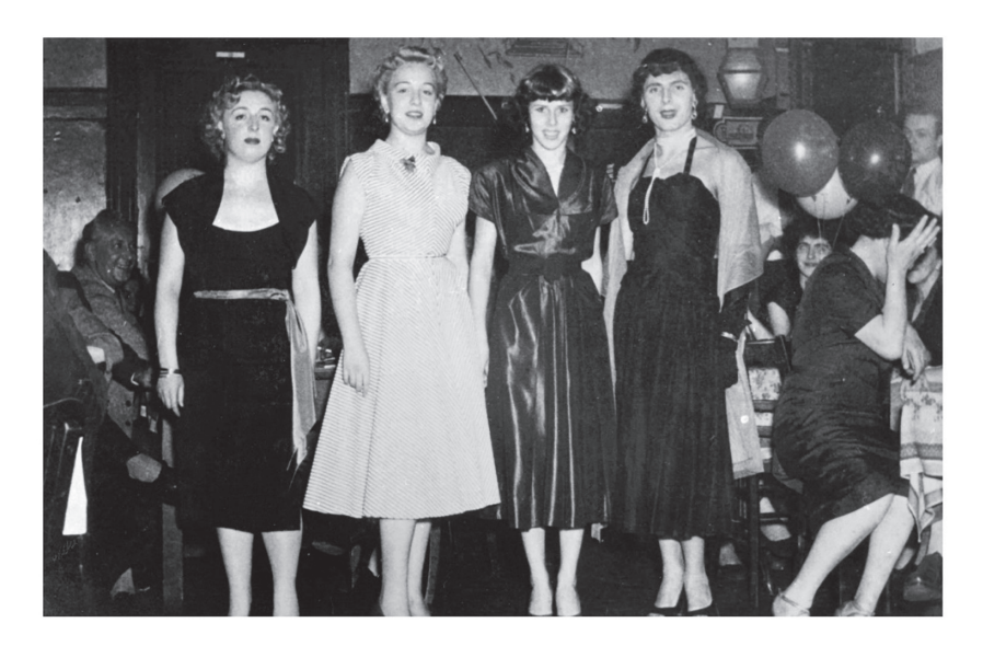
Figure 2.5. Boheme bar.

Boheme photo album embodies, I argue in this chapter, is precisely what characterizes the space of the gueer bar in postwar Berlin: play and persecution, sociability and surveillance, dancing and detention.<sup>2</sup> In the following pages, I will describe these dynamics as they changed over the period of the two and a half decades after the war. I will do so by highlighting the practices of space-making that different actors who held a stake in queer bars engaged in. As I will show, queer bargoers and the West Berlin police were only two players in a large cast of characters, which included the West Berlin city government and district offices, newspapers, bar owners, as well as West Berlin's tourism office, which had an acute interest in marketing the city's nightlife as the most thrilling this side of the Iron Curtain. At least until 1961, the Stasi, the East German secret police, also kept an eye on West Berlin's bars, both to control its own queer citizens and to gather information about "the class enemy," whether represented by West Germans or members of the Allied forces.