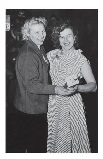
Figure 2.2. Boheme bar.

location stands in tension with the familiarity, even intimacy, between camera and subjects suggested by the images. What does it mean that this testimony to queer exuberance is found in the archives of an institution that played a key part in surveilling, shutting down, and sanctioning the very scenes displayed in its pages? The tension that the