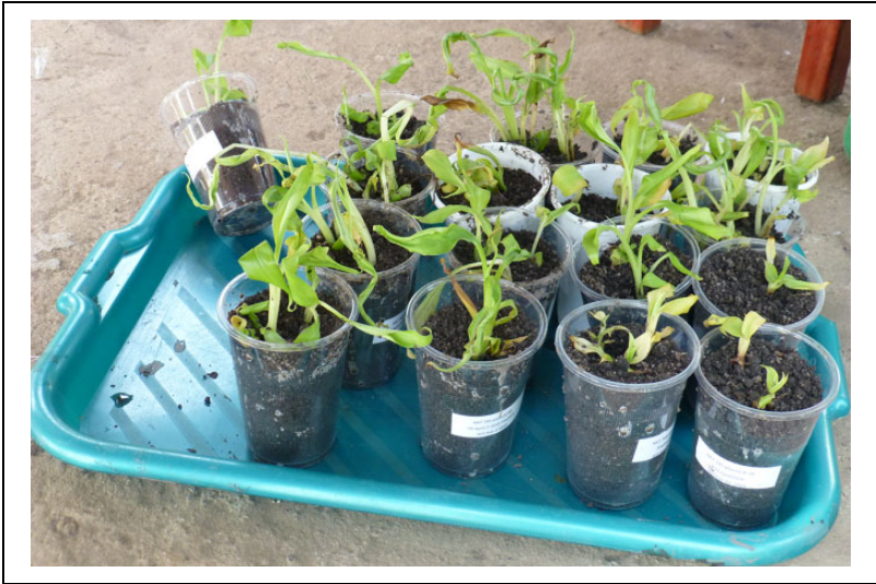
Figure 5. Freshly weaned banana plants, February 2016.