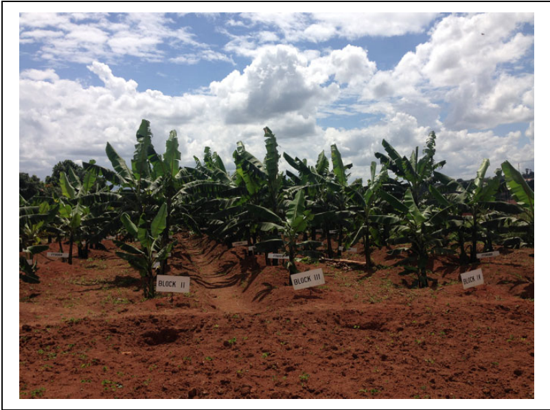
Figure 1. The Ugandan trial field of genetically modified bananas, July 2015.

auspices of the Ugandan Ministry of Agriculture; most other projects here are rather agronomic in their orientation. The vitamin-enriched or “biofortified” banana ( matooke ) is a special project due to its length, its technical equipment, and the ways in which it merges scientific sophistication and the goal of contributing to public health through an agricultural product—a transgenic micronutrient-enriched banana that can be grown by Ugandan farmers across the country.