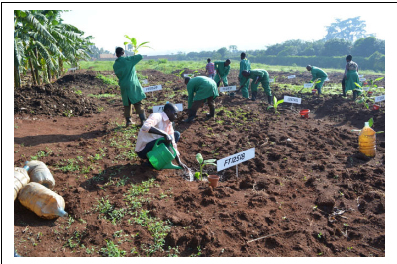
Figure 3. Planting an extension of the field trial, August 2017.