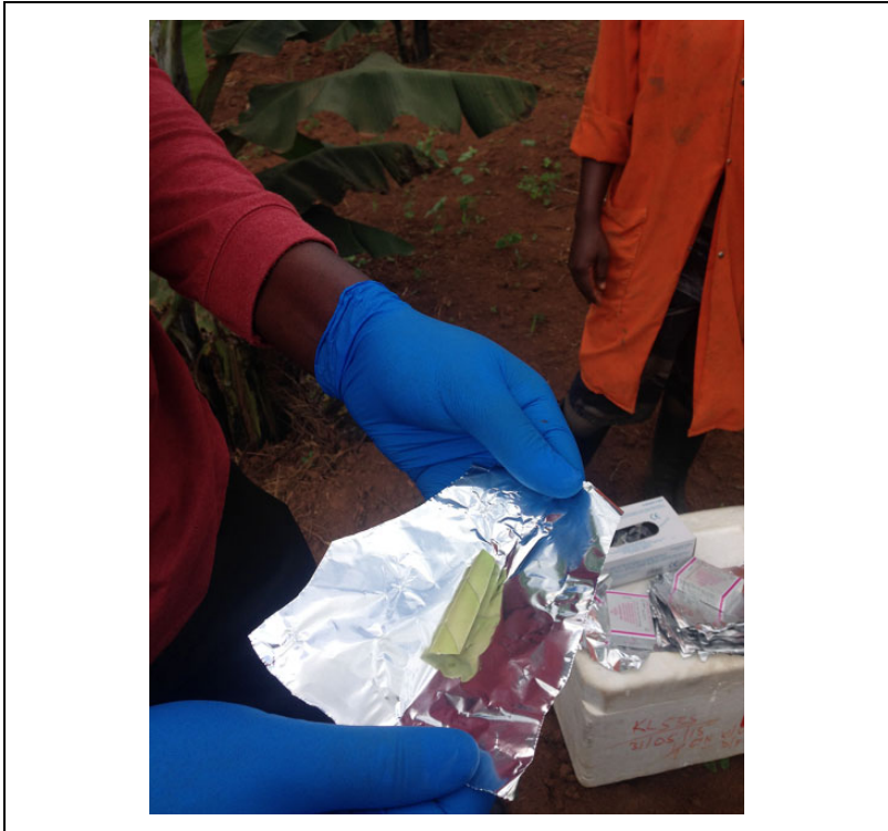
Figure 4. A cutting of the cigar leaf for lab analysis, June 2015.