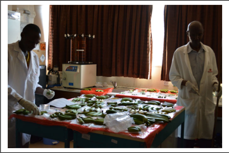
Figure 6. Preparing harvested bananas for lab analysis, September 2017.