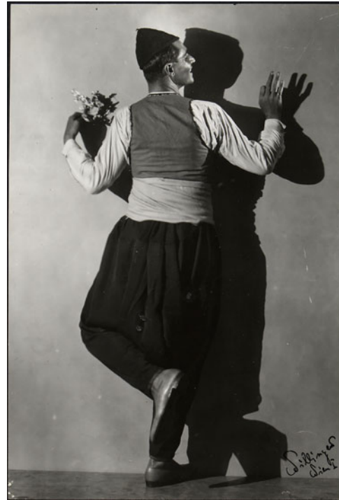
Photo 3. Baruch Agadati in Arab Jaffa (1927).

Yet, though commonly and—at least until 1936—legally practiced, homosexuality was heavily excluded from the early Zionist discourse. As Ofri Ilany has shown, in pre-State Israel and in the early years of the State of Israel, male homosexuality was regarded as a threat to the Zionist project because of the constructed cultural connection between homosexuality and the Orient.