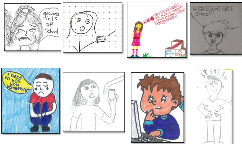
Figure 4. Examples of cybervictims’ emotions. From left to right in both rows, Sadness, Surprise, Joy, Anger. The phrase “Gewwon jets op school” means “Just something at school”; the sentence “Raga ditemi chi è stato!!!” means “Guys tell me who did it!!!”.