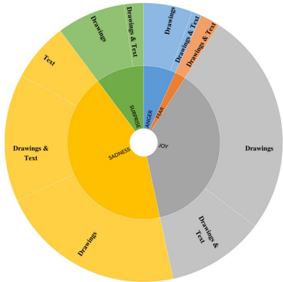
Figure 2. Emotions by visual and text representations. The innermost circle represents the emotions; the external circle is the visual representation for each emotion.