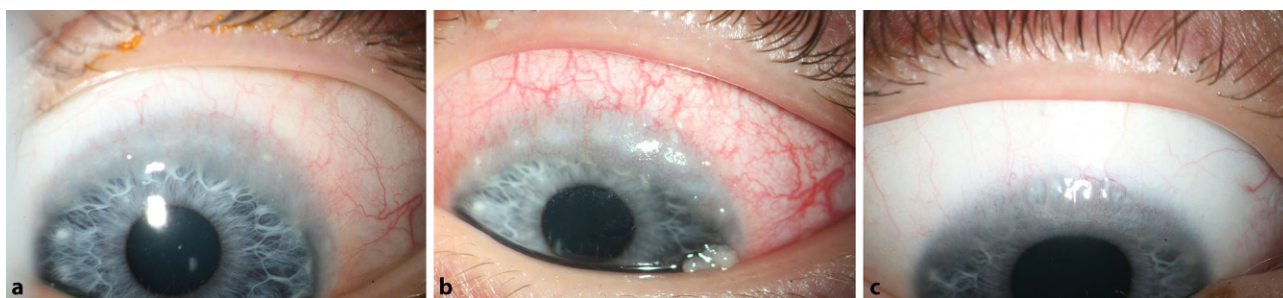
Fig. 1 Patient A: a vernal keratoconjunctivitis (VKC) grade 3, presenting with Trantas dots as sign of eosinophilic infiltration at 10 years of age; b corneal pannus with neovascularization and mucus discharge 10 months later (VKC grade 3–4);

c 9 months after treatment with omalizumab every 2 weeks 300 mg subcutaneously, neovascularization regressed (VKC grade 1)