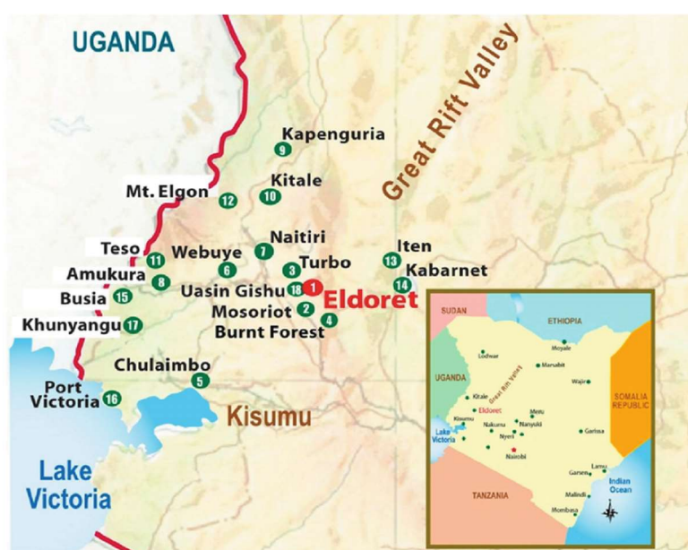
S1 Graphic. Distribution of AMPATH clinics in western Kenya

Note. Data adapted from NASCOP. MOH 731 - Comprehensive HIV/AIDS Facility Reporting Form. Report. Programme NASC; 2018.