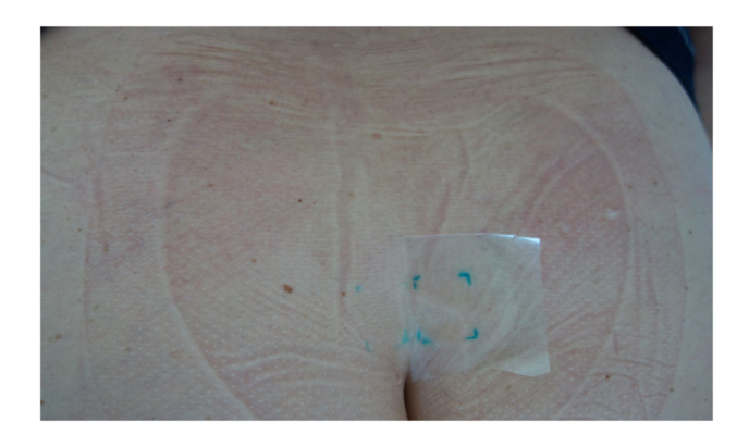
FIGURE 1 Erythema after 3.5 hours loading and removal of one experimental dressing; at right investigational area: adhesive tape for the cyanoacrylate skin surface stripping (during hardening period) [Color figure can be viewed at wileyonlinelibrary.com]

The baseline skin temperatures of approximately 30°C were comparable between the groups. After the lying period, the median temperature increase ranged between 3.0°C in the ALLEVYN Life Sacrum group and 3.8°C in the Mepilex Border Sacrum group. The median SCH at baseline was between 24.8 and 30.1 AU. After lying 3.5 hours in supine position there was an increase in all groups ranging from a median of 4.4 AU (IQR 1.2 to 11.5, Mepilex Border Sacrum) to 7.3 AU (IQR 3.6 to 15.0 AU, Optifoam Gentle Sacrum). The second highest increase in stratum corneum hydration was observed in the group without a dressing. The erythema values at baseline were comparable, but loading differences were subsequently detected between the groups. There were high median increases of erythema in the no dressing (median 29, IQR 19-49) and ALLEVYN Life Sacrum (median