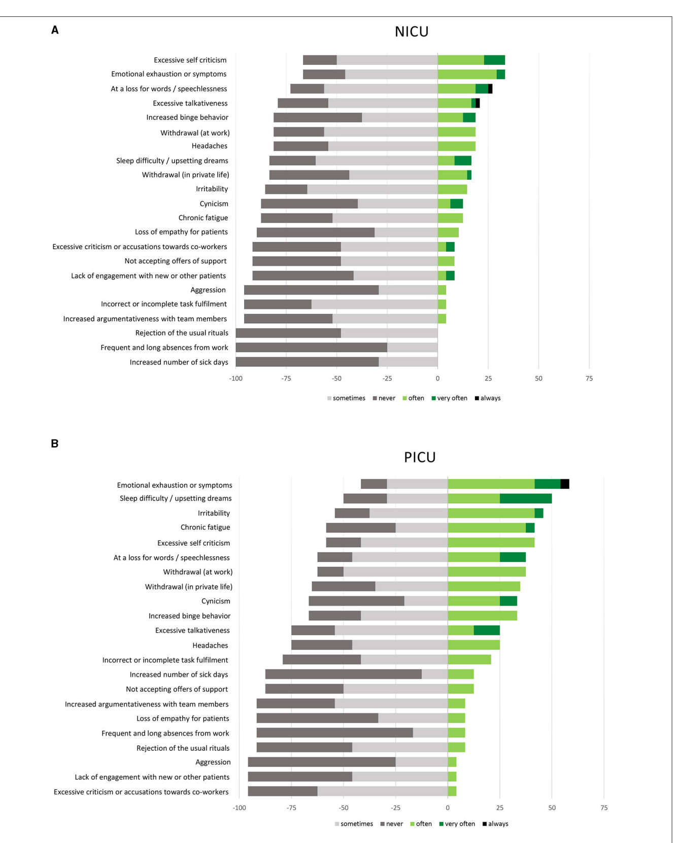
FIGURE 2 | Most frequent distress-related reactions or symptoms as self reported by (A) NICU staff and by (B) PICU staff (%). All questions to be rated by using a five-point Likert Scale.