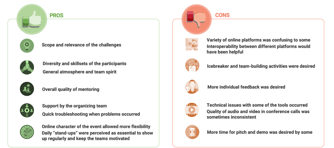
Figure 3. Experiences of participants specifically regarding the remote and online nature of the hackathon.

Before the hackathon, participants rated their confidence in starting a digital health venture or research project with 2.6 points out of 5 on average. After the hackathon, the participants' confidence increased significantly to 3.7 on average. Of the participants, 60% (n=18) would not have started their projects without attending this hackathon, and agreed that it enabled them to progress faster by (1) offering new insights and feedback provided by the mentors, (2) creating a functional prototype, and (3) finding the right members for their team.