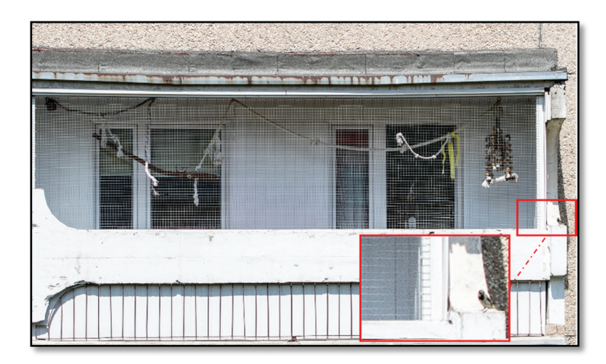
Figure 1. Home balcony keeping ornamental birds in Wałbrzych, Poland [author: Emil Paluch] (as the example of potential Salmonella spp. transmission from wild, free-living birds (zoom on the lower, right arrow) to ornamental birds outdoor).

Diet of cats and dogs is as varied as any omnivores; however, animal feed predominates, including raw meat [56]. Newborn cats and dogs consume their mother's milk; however, dogs may also consume placenta and colostrum, which is beneficial for the formation of a healthy microbiota. Owners of older animals often introduce a diet of raw meat, including poultry [57]. According to a large, structured, 2016 survey in the US, 3% of dog and 4% of cat owners feed their pets in raw products, and raw or cooked human food was purchased for pets by 17% of dog owners [3]. Such a diet, despite its many benefits, carries a high risk of Salmonella spp. infection. For instance, Finley et al. [58] observed that when dogs are fed with Salmonella-contaminated food, they can become infected and consequently shed the bacteria in their faeces to contaminate the environment, other domestic animals, and even pet owners [58]. Experimental addition to dog's diet probiotics