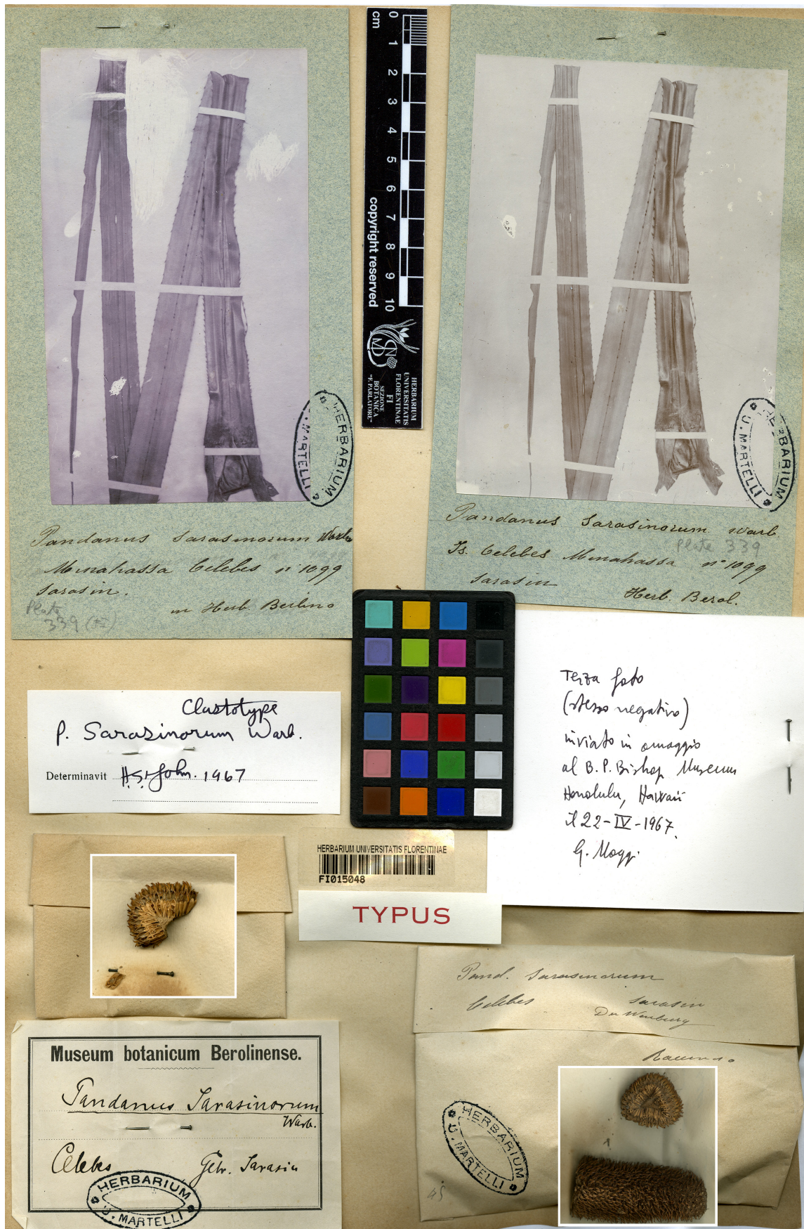
Fig. 6. Lectotype of Pandanus sarasinorum : Sarasin 1099 (FI015048). – Image © Università degli Studi di Firenze, Museo di Storia Naturale, Collezioni Botaniche.