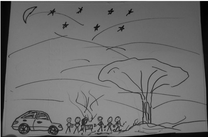
Figure 3. A ‘mental map’ of a shashlyk gathering by Bek, one of my interlocutors.

Significantly, shashlyk have a nocturnal dimension at their core which is well reflected in the ‘mental map’ drawn by one of my interlocutors. It depicts a company of tiny, smiling, stick-figures gathered around a steaming grill in what looks like an isolated natural location marked by a gigantic baobab-like tree and a vast starry moonlit sky (see Figure 3).