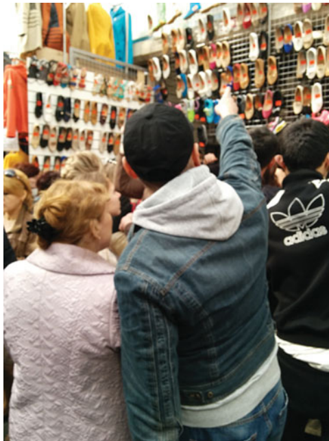
Figure 2. (Colour online) A seller shows shoes to a potential customer.

The space of the market allows for migrant subjects to be loud and noisy as opposed to quiet and invisible. Silence and invisibility seem to have become the customary behaviour adopted by external migrant workers in public spaces, and especially at home. This is largely due to the risk of being reported to the police by neighbours who might suspect that a flat is accommodating large numbers of workers who lack relevant registration documents. This might lead to police raids, detention, and pricey extortion. In contrast to the space of home, therefore, the marginal hub of the market allows for the sonorous becomings of migrant subjects and for multiple rhythmicities. The cacophony of different languages and the clang and continuous chatter have been cited by some of my interlocutors as particularly enjoyable aspects of their day. The humorous calls of male hawkers and the repetitive entreaties of female hawkers urging customers to enter a shop blend with multilingual chatter, slick advertisements broadcast from the market's central speakers, and criminally or romantically