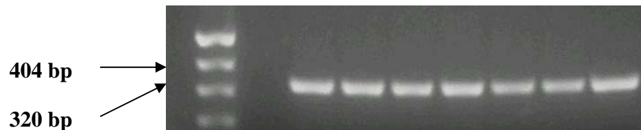
Fig. 8d. Beta-glucuronidase mRNA expression in SZ95 sebocytes (336 bp). The enzyme was used as housekeeping gene

RT-PCR analysis: SZ95 sebocytes after 1 h incubation. Lanes: 1. Molecular weight marker; 2. Untreated cells; 3. Cells treated with AA (100 \mu M); 4. Cells treated with CaI (0.1 \mu M); 5. Cells treated with AA (100 \mu M) and CaI (0.1 \mu M); 6. Cells treated with CaI (1 \mu M); 7. Cells treated with AA (100 \mu M) and CaI (1 \mu M). 8 \mu l of each RT-PCR product was mixed with 2 \mu l loading dye (5X) and then the samples were run in 2% agarose gel containing ethidium bromide. The bands were visualized after UV-light exposure. In the case of 5- and 15-LOX, 20 \mu l of each sample and 5 \mu l dye were loaded, instead of 8 and 2 \mu l, respectively.