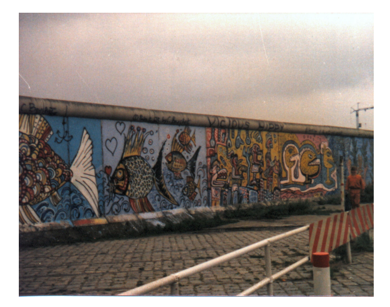
Fig. 2 | Photograph of the Berlin Wall, 1985.

zone – or even a multitude of smaller contact zones.<sup>14</sup> Indeed, attention has been brought recently to the local and inter-regional interaction of Mediterranean island communities during the Bronze Age, although several aspects have not been well-understood; e.g. the geographic extent of the island communities' (political organization), the reach and nature of their interaction among each other and with the mainland, and the negotiation of space.<sup>15</sup> In other words, the boundaries on the sea, their role in human interaction and their regulation by adjacent communities are unclear with respect to premodern times. Yet, it stands to reason that they also fit in with the network of mutual interdependence in facilitating long-distance exchanges as proposed for the Bronze Age,<sup>16</sup> incorporating cities, rural communities, coastal and island communities and possibly providing for softer borders between polities than under the current nation-state framework.<sup>17</sup> Research agendas focusing on the Mediterranean could probably also be adapted to suit research on the premodern organization of other island communities, such as in Southeast Asia or the South Pacific.