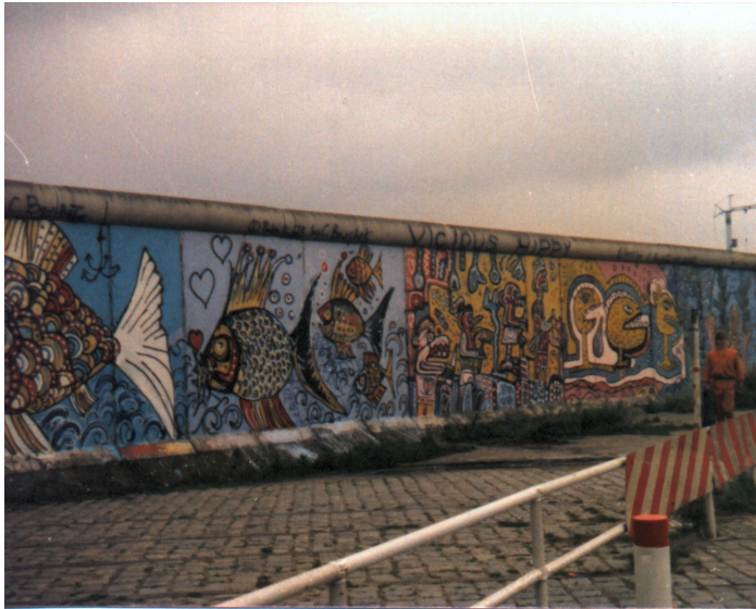
Fig. 2 | Photograph of the Berlin Wall, 1985.

zone – or even a multitude of smaller contact zones. 14 Indeed, attention has been brought recently to the local and inter-regional interaction of Mediterranean island communities during the Bronze Age, although several aspects have not been well-understood; e.g. the geographic extent of the island communities' (political organization), the reach and nature of their interaction among each other and with the mainland, and the negotiation of space. 15 In other words, the boundaries on the sea, their role in human interaction and their regulation by adjacent communities are unclear with respect to premodern times. Yet, it stands to reason that they also fit in with the network of mutual interdependence in facilitating long-distance exchanges as proposed for the Bronze Age, 16 incorporating cities, rural communities, coastal and island communities and possibly providing for softer borders between polities than under the current nation-state framework. 17 Research agendas focusing on the Mediterranean could probably also be adapted to suit research on the premodern organization of other island communities, such as in Southeast Asia or the South Pacific.