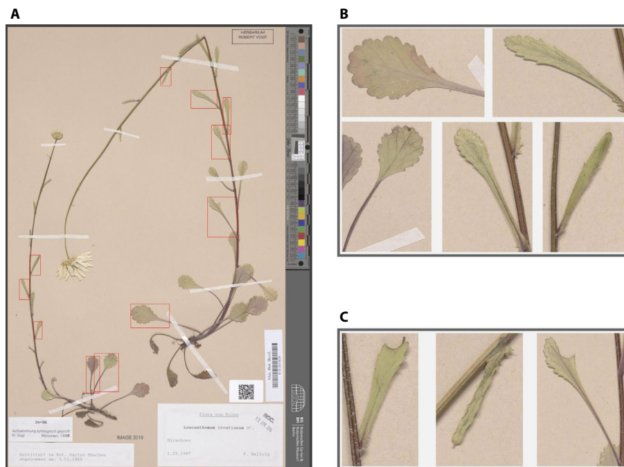
FIGURE 2. (A) Output type ‘ibb’ (image with bounding boxes) showing class-wise predicted bounding boxes of leaves with a score of 0.5 or higher drawn on the original image of a herbarium specimen. The score can be interpreted as a probability that the content of the bounding box belongs to a certain object class (in this case, a leaf). (B) Output type ‘ebb’ (extracted bounding boxes with a padding of 25 pixels) for selected true positive examples of the detected leaves shown in A. (C) Output type ‘ebb’ for selected false positive examples of the leaves shown in A.

recognition for the exploration and exploitation of the rich treasure that digitized herbarium specimens in collections all over the globe represent. Here, we have shown that our pipeline is able to automatically extract intact leaves from herbarium specimen images for subsequent downstream analyses. This provides the potential to speed up and automatize previously work-intensive manual workflows, and can grant scientists access to huge amounts of morphological data for morphometric and phenological studies using herbarium specimens.