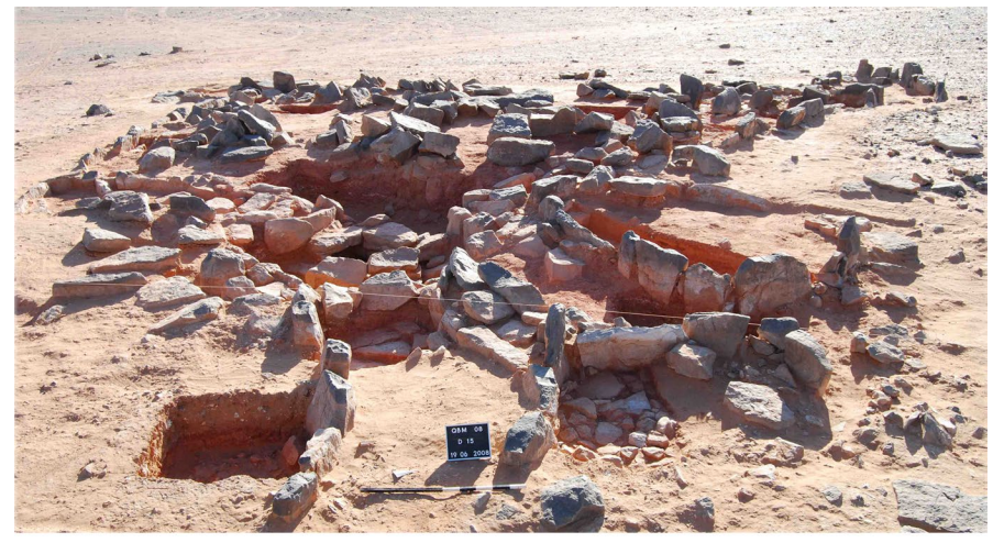
FIGURE 5 Qulban Beni Murra north Jabal at-Tubaiq, southeastern badia . Canal-type trough system fed by a well typical for the pastoral Rajajil Cultures (late fifth millennium BCE). (Eastern Jafr Archaeological Project; plan: C. Purschwitz) [Colour figure can be viewed at wileyonlinelibrary.com]