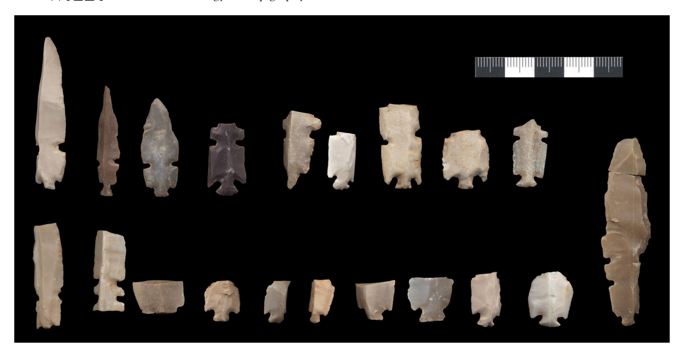
FIGURE 2 'Ainab 1, Structure A, close to Jabal 'Ainab, southeastern badia : Helwan points from an EPPNB megalithic hunting camp hosting a bidirectional primary production: Just representing a techno-stylistic incursion? (second half of the ninth millennium BCE). (Eastern Jafr Archaeological Project) [Colour figure can be viewed at wileyonlinelibrary.com]