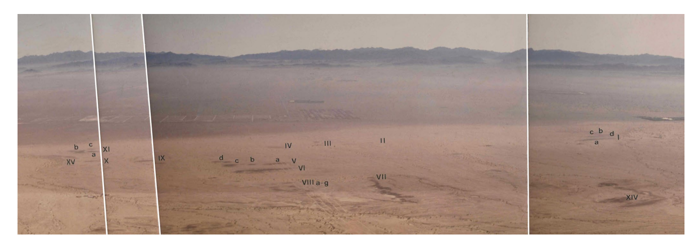
FIGURE 3 Mazyad sites panoramic view in 1980 from Jabal Hafit, Abu Dhabi Emirate: Ephemeral dwelling at flint mining sites with surplus foliate production (sixth–fifth millennium BCE). [Colour figure can be viewed at wileyonlinelibrary.com]

original cultures. However, for much of the evidence in the fringe areas, it might be difficult to understand the overlapping features of both.