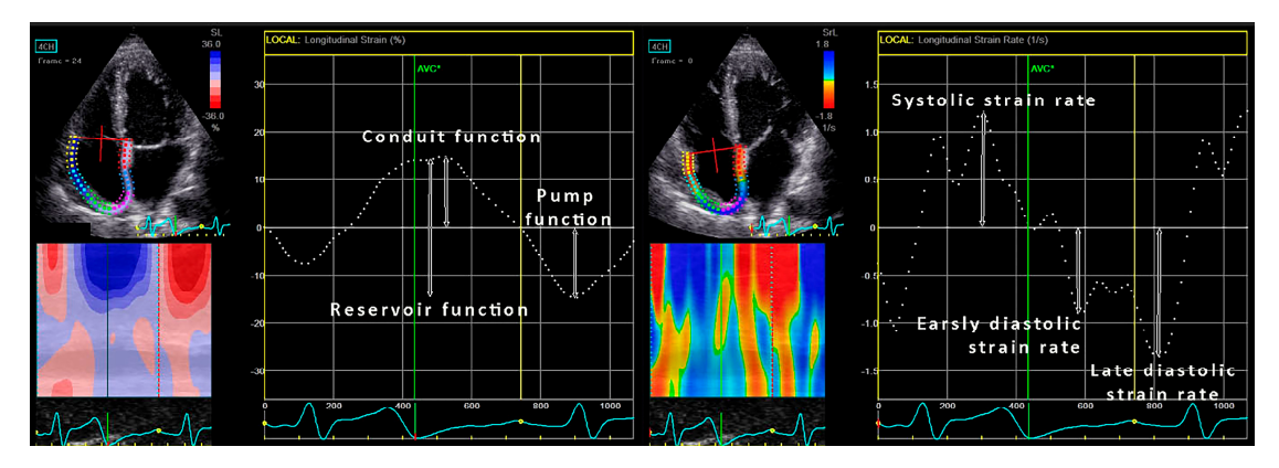
Figure 2. Right atrial strain and strain rate analysis in the four-chamber view.