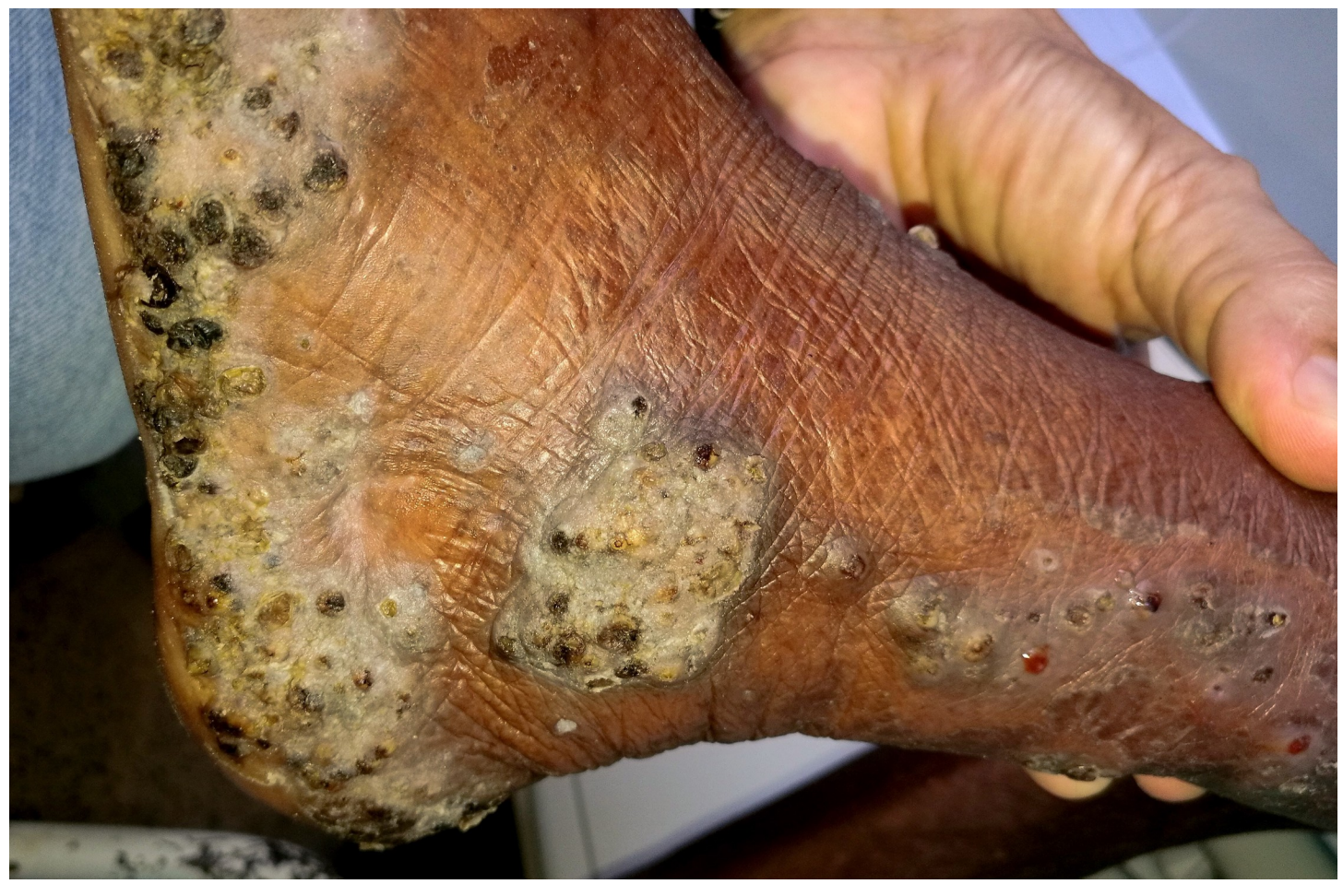
Fig 3. Clusters of embedded sand fleas at the ankle and the lateral side of the lower leg. https://doi.org/10.1371/journal.pntd.0007068.q003

this case series is small, it identified a pattern of characteristics which together determine that a self-limiting skin infection develops into a life threatening disease. Understanding of these determinants of very severe tungiasis allowed the development of a surveillance scheme by the Ministry of Health and Social Protection of Colombia.