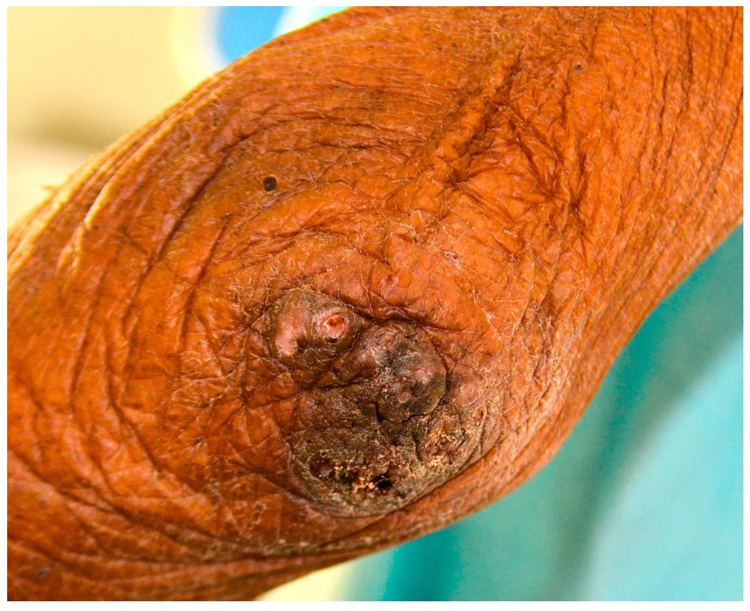
Fig 4. A cluster of embedded sand fleas at the elbow.

https://doi.org/10.1371/journal.pntd.0007068.g004