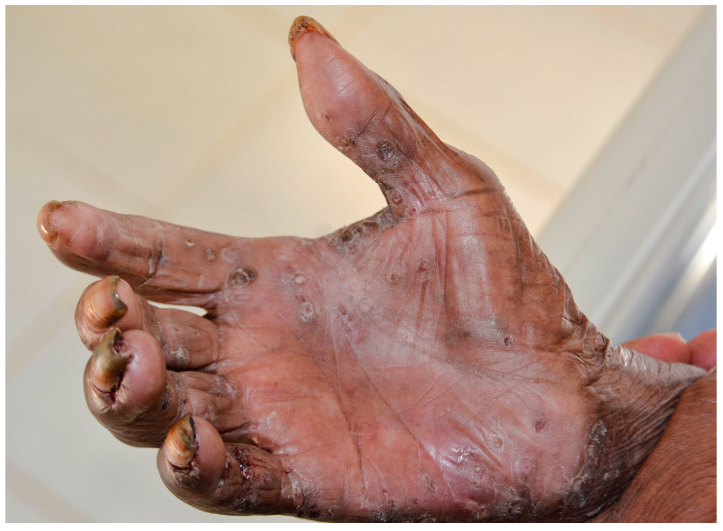
Fig 6. Ectopic localization of embedded sand fleas in the palm of the hand.

https://doi.org/10.1371/journal.pntd.0007068.g006