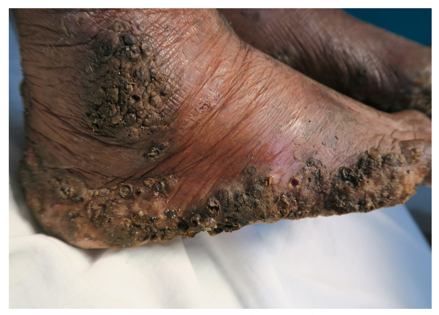
Fig 2. Lateral rim of right foot of the same patient as in Fig 1. Several layers of embedded sand fleas are located on top of each other. A larger cluster of parasites is located at the ankle.

This case series shows that very severe tungiasis still occurs, but goes unnoticed by health care providers because the patients are living in remote settings in the hinterland and do not have access to health care. The short period in which the five patients were identified indicates that very severe tungiasis is expected to occur in many Amerindian communities. Although