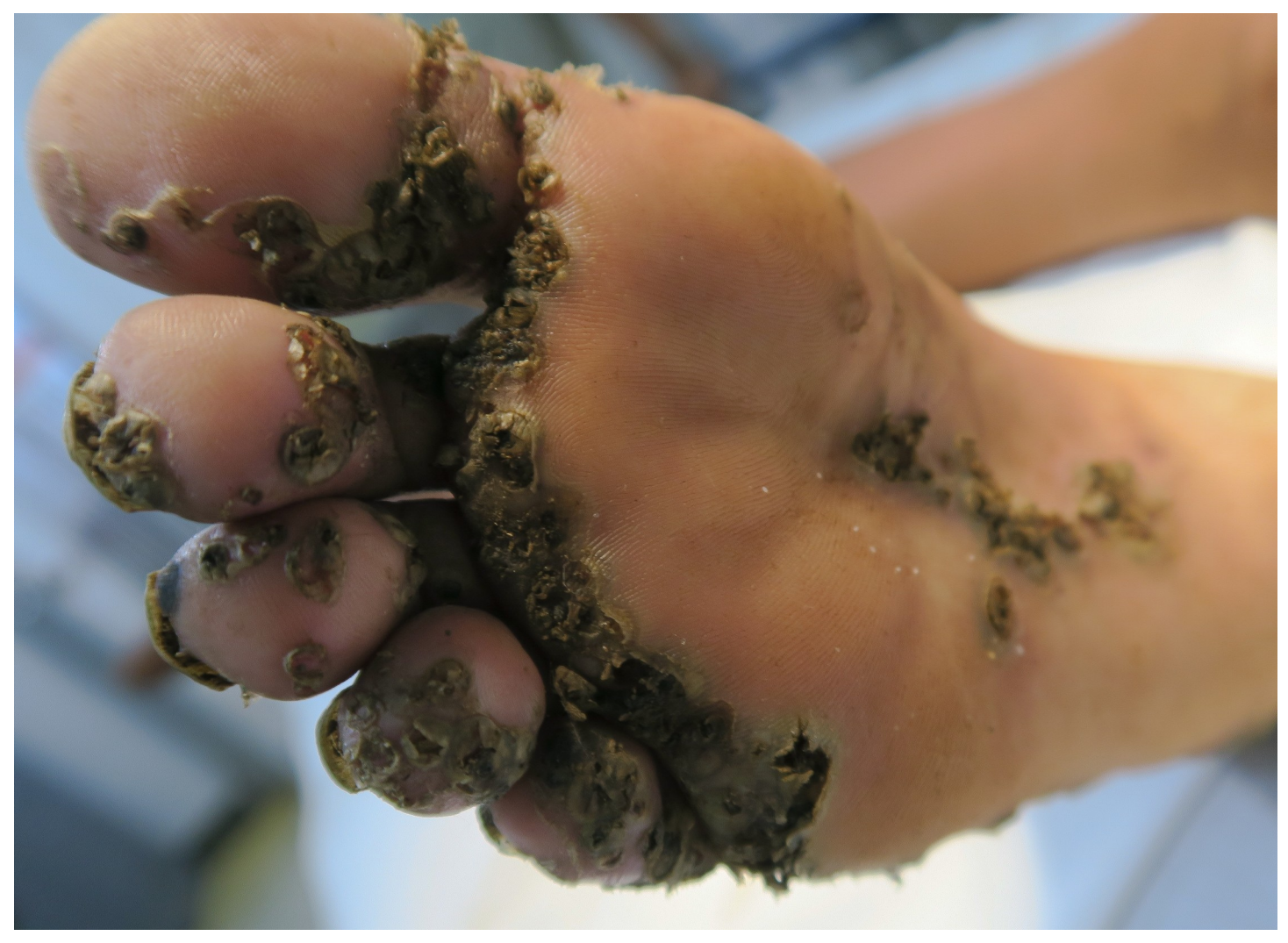
Fig 7. A cluster of embedded sand fleas at the sole below the toes and the interdigital area.

https://doi.org/10.1371/journal.pntd.0007068.g007