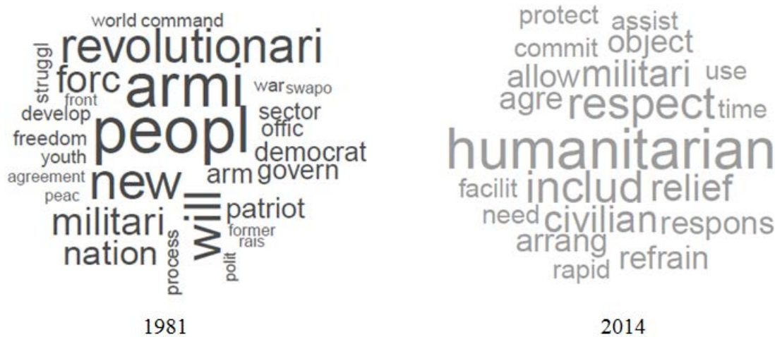
Figure 2. Comparing Non-State Armed Actors' Words-in-Documents Overtime, 1981 and 2014

The statements by FARC in their main website, provide examples of changing rhetoric over time. 20 The origin of rebellion and insurgency often stems from the rejection of state-centric system. Especially in Marxist movements, international law is something that was imposed by hegemonic rules. For example, in 2001, Gabriel Angel, a FARC commander, criticized IHL as a tool to expand US hegemony, 21 pointing out exclusion of “Peoples” in the law-making process.