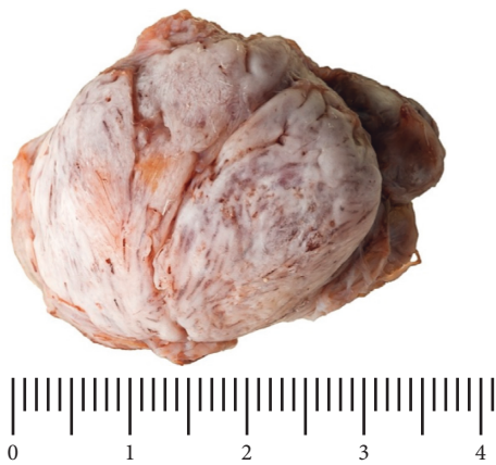
FIGURE 2: Display of the removed formalin-fixed specimen ( 37 \times 22 \times 22 mm, 12 g, presenting as a round, bony mass smoothly covered by a narrow lamella of connective tissue).

Histopathology of the specimen processed with a haematoxylin and eosin staining revealed a round, bony mass smoothly covered by a narrow lamella of connective tissue. Beneath the surrounding compact bone, the structure consisted of cancellous bone tissue with regular medullary cavities enclosing yellow marrow, as well as differently sized areas of mature hematopoietic bone marrow, suggesting an ectopic formation of regularly differentiated bone tissue (see Figure 3).