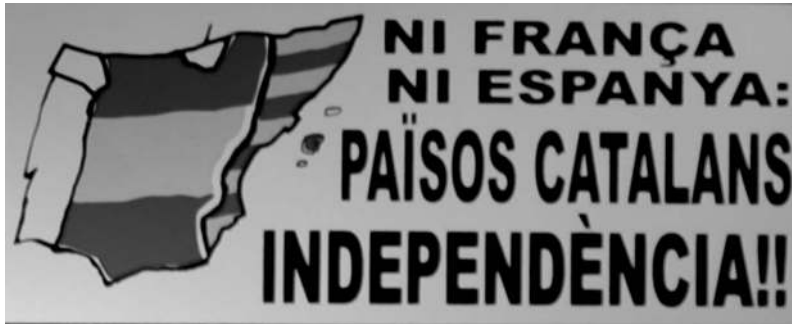
Fig. 3 “Neither France nor Spain: Països catalans Independence?”

that ‘new’ territorial imaginations, which evade current administrative borders, refer ironically to historical administrative borders that ‘doze’ in the collective memory.