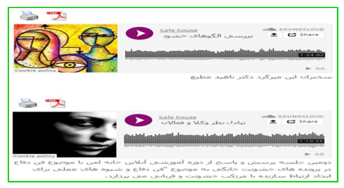
Figure 6.2: Safe Home podcasts produced to train activists. Retrieved May 02, 2015, from http://www.khanehamn.org/archives/category/podcasts. In the public domain.

The amount of informative materials that are principally of use to activists was relatively lower in the other cases. Bidarzani.com presented legal documents and guidelines about the country's Family Protection Law. The Stepdaughter website published an interactive diagram describing the chronology of Marriage with Stepdaughter clause, and linked viewers to numerous legislative and official documents compiled by campaign activists. The Women for Parliament website published a number of articles about how women's rights activists can affect parliamentarians' decision-making.