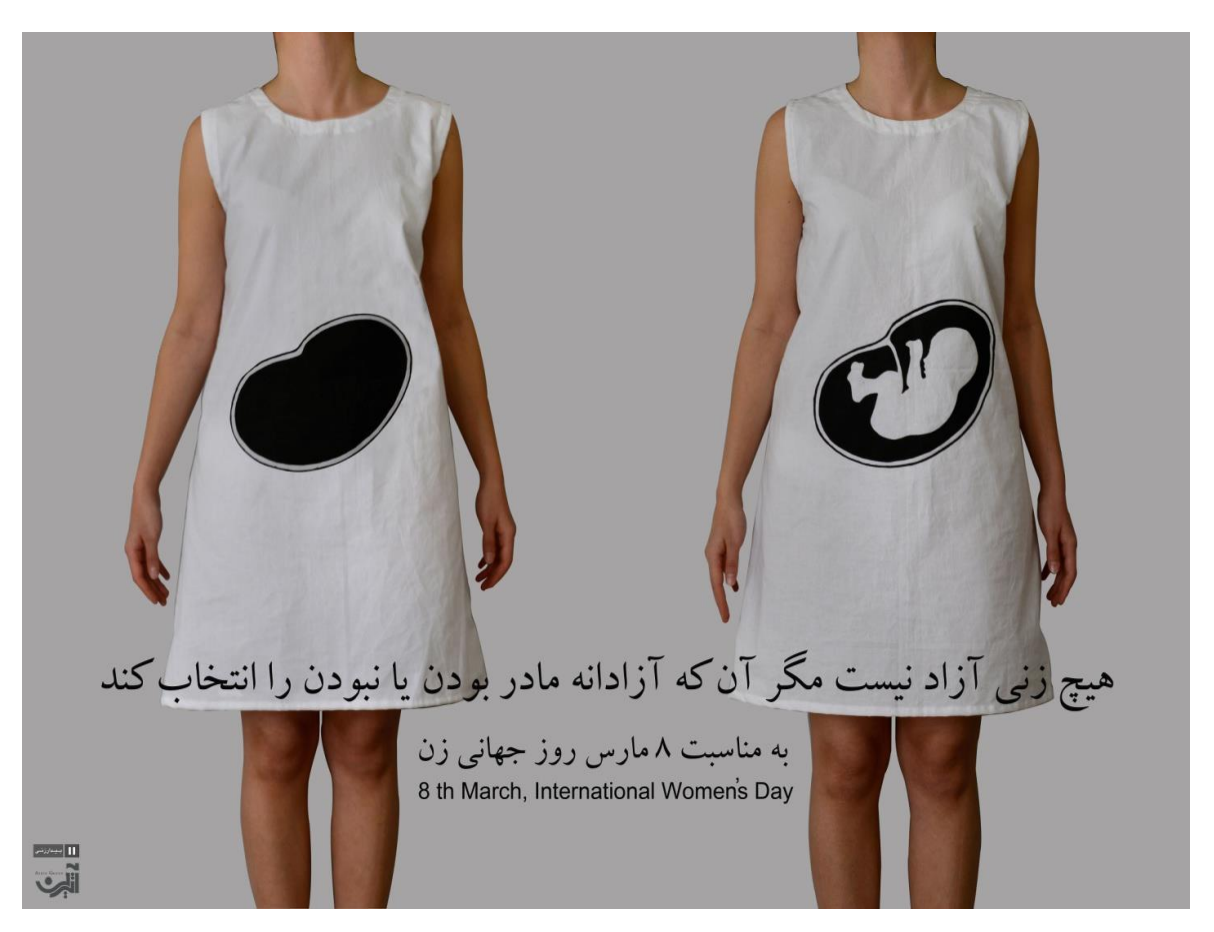
Figure 5.2: A poster published on the Bidarzani website on International Women's Day about women's reproductive right.

domestic violence, in particular sexual violence. For instance, the group published a series of warning signs indicating that a woman or a child has been affected by sexual abuse. The website also published many stories of women suffering from domestic abuses, many of which are based on cases of women who contacted the center for advice. Intriguingly, this group hardly used its Facebook profile to offer such educational materials. For the most part, its Facebook posts were of photos about peace and love in the family, sometimes with inspirational quotes from literatures and famous people.