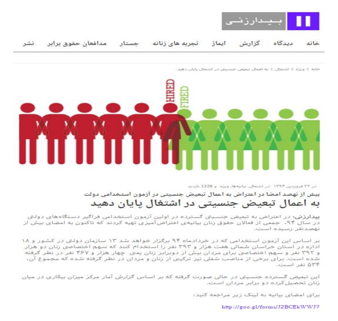
Figure 5.1: An open letter to Rouhani's government and a link to its online petition published on Bidarzani website. Retrieved April 27, 2015, from http://bidarzani.com/21616. In the public domain.

A finding emerged from the interview analysis should be noted here. Three respondents hold the notion that activists' online sites have not only pressured officials by reporting their actions, they have also moderated the hostile attitudes of many politicians towards women's rights activism and its discourse. These interviewees believed that activists' online sharing of information to the public has affected the attitude of politicians towards the nature and demands of women's rights activists. Interviewee 2, who had direct interaction with politicians due to her journalism career, declared that: