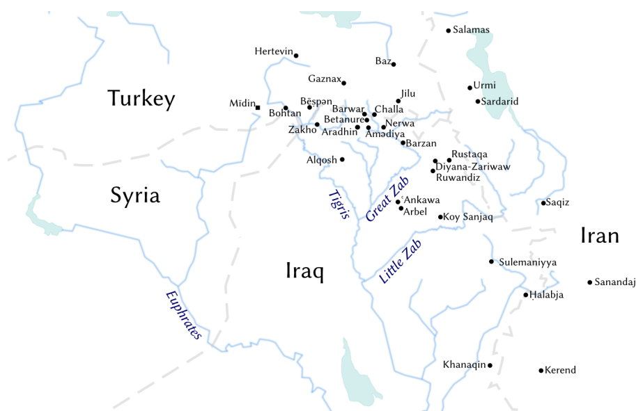
Figure 1.1: Approximate locations of NENA dialects (and one NENA dialect: Midin) at the beginning of the 20 th century.

collected as well, but for methodological reasons are not treated in the book.