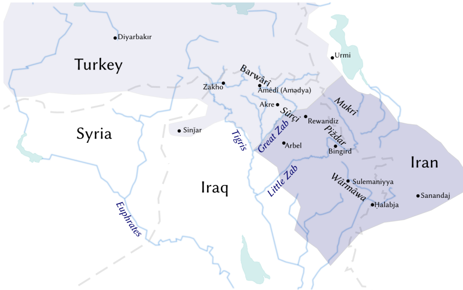
Figure 9.1: Map of surveyed Kurdish dialects and localities. Light grey = Kurmanji dialects; dark grey = Sorani dialects.

pear regularly in one of the Ezafe constructions, yet they can also appear in some alternative constructions, which are discussed in §9.7. The usage of the juxtaposition construction, as well as the rare inverse juxtapositioninverse juxtaposition construction, is presented in §9.8. Finally, §9.9 concludes this chapter with some general remarks and comparative prospects.