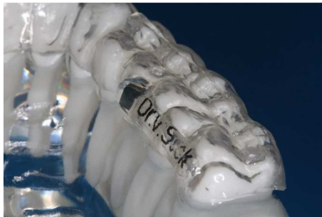
Fig 2. Medical device on dental model. (A) Splints are almost invisible on the front teeth of the upper and lower jaws. (B) linear increase over the upper posterior molars reduces the chewing area to about one fifth.

https://doi.org/10.1371/journal.pone.0174528.g002