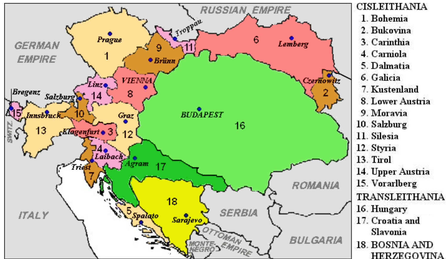
Map1: the provinces and province-capitals of the Habsburg Empire prior to 1914