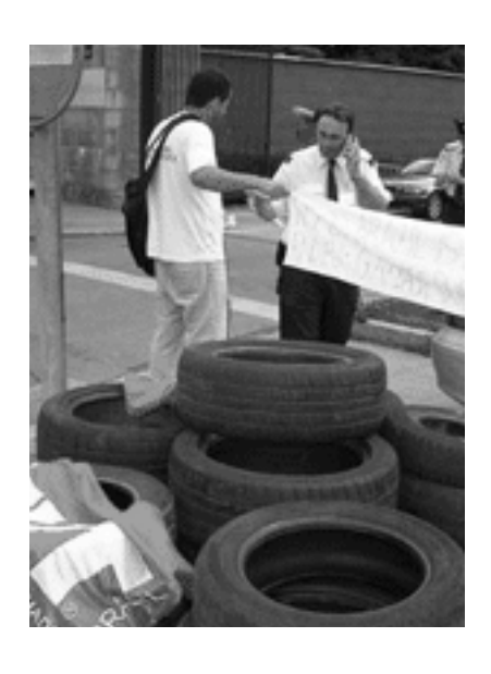
Figure 3: Civil Society Organizations' Demonstration before the WTO Building on 4 September 2006

Interestingly, one of the main problems cited by the organization was to find environmental and human rights organizations willing to enter the "trade and" agenda. In fact, only after concerted effort did the organization manageto find enough confirmed invitees to hold the initiative. The demonstration held in Geneva also reflected these limitations, in fact, it was a one-man demonstration. With very little help from others, one member of the Brazilian Forum of NGOs and Social Movements for the Environment and the Development (FBOMS) travelled to Geneva, rented a truck filled with tyres and dumped its content before the WTO building while holding up protest signs.