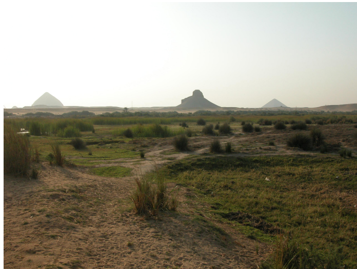
Fig. 1 | The Pyramids of Dahshur are visible from a great distance (here 2.5km).

The construction of a pyramid complex was the main building project of a king in the Old Kingdom (about 2650–2150 BCE). All pyramids were erected at the Western Desert escarpment within a maximum distance of about 25km opposite the former capital of Memphis. 1 Due to their size and their location on the Egyptian Limestone Plateau, these monuments could be seen over vast distances. By means of their monuments, the socially distant god-kings of Ancient Egypt were always visually present. Thus, the political structure was translated into architectural forms and mapped onto the landscape. 2