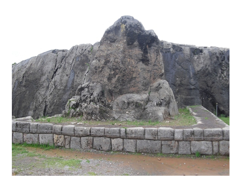
Fig. 3 | Upright stone monolith surrounded by low stone wall at site of Q'enko located above and outside the city of Cuzco.

The 1 \times 2 meter excavation unit reportedly produced dense quantities of undecorated domestic pottery, together with camelid, deer, and cuy (guinea pig) bones. These materials were interpreted as evidence of large-scale feasting carried out in direct association with the buaca .<sup>37</sup>