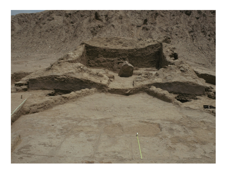
Fig. 4 | Temple of the Sacred Stone at the site of Tucume on the north coast of Peru.

I offer one final example from the northern highlands. In late pre-Columbian times, one of the most renowned deities of the Andean realm was the powerful oracle known as Catequil. Archaeological excavations recently undertaken in the vicinity of the mountain traditionally associated with this oracular huaca (Cerro Icchal) have produced significant architectural remains.<sup>39</sup> At one of the artificial mounds situated near the base of this mountain, an architectural complex interpreted as the main sanctuary of the oracle Catequil was unearthed with a network of associated canals and drains, and a patio made of river rolled cobbles. On another mound located slightly below this and dating to the earlier Middle Horizon period, investigators recovered quantities of fine Cajamarca cursive style pottery bowls.<sup>40</sup>