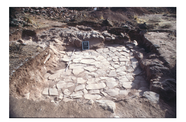
Fig. 2 | Large stone outcrop (huaca) at far end of restricted-access room at site of Choquepukio surrounded by flagstone floor (huaca and stone-covered canal at far end of room).