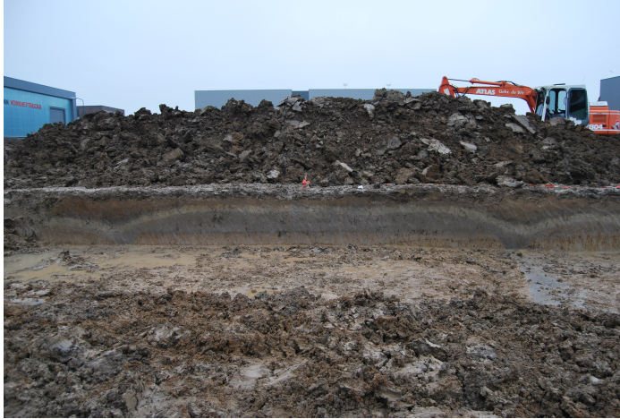
Fig. 1 | Profile of one of the excavated burial mounds.