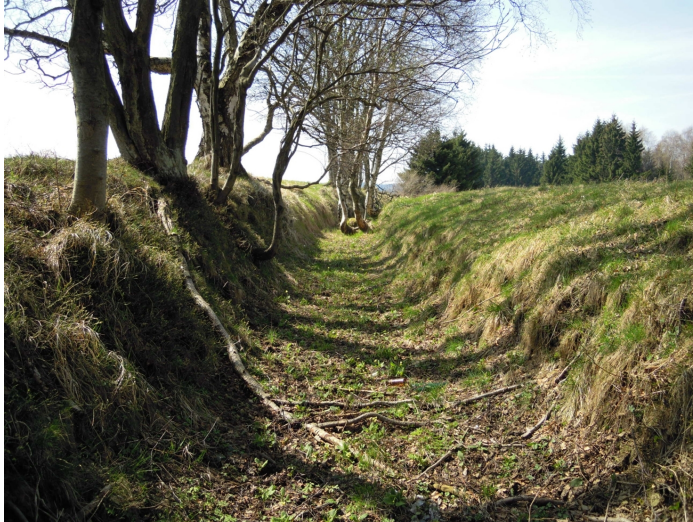
Fig. 1 | Old, inactive road gully is well preserved in the landscape due to grass cover and tree roots.

agricultural terraces are evidence of former ploughing while nowadays they occur within hay meadows and pastures. The average height of the terrace scarps is 0.5–1.5m. Other landforms connected with former agricultural land use are embankments and heaps of stones collected by farmers from arable grounds to facilitate ploughing. Nowadays they are usually overgrown by vegetation, mainly by xerophilous species, due to the high permeability of their loose, open-work structure. They are a common landscape feature and vary in density and size. The height of these landforms ranges between 0.5 and 3m (usual value is 1.2–2.5m) while the length of stone ramparts may reach up to 350m. Some of the ramparts used to have a form of regular stone walls. However, they have collapsed in many places and their previous structure has been obliterated.