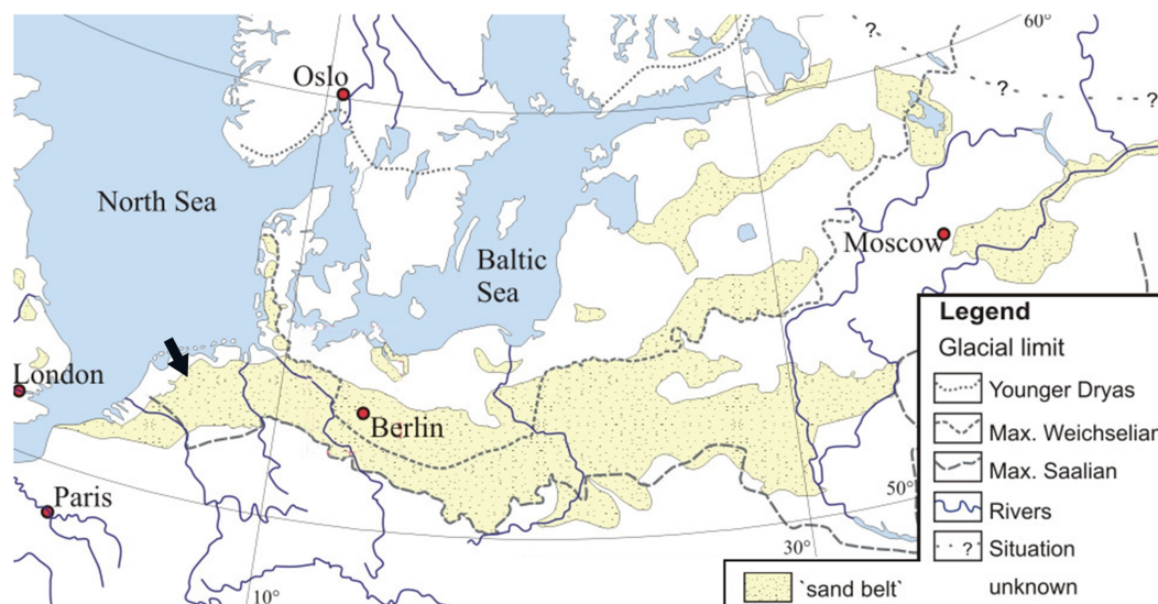
Fig. 1 | The European aeolian sand belt (after Hilgers 2007). Arrow indicates research area.

development schemes in stream valleys. 8 A systematic investigation, and protection, of this inland wetland archaeology has proved to be challenging because of its unpredictable nature and generally adverse research conditions. Nonetheless substantial progress has been made, resulting in predictive models of the distribution of archaeological phenomena based on archaeological as well as historical-geographical patterns in areas contiguous to watercourses. 9 Guidelines have been developed to allow targeted research and improve effectiveness and cost-efficiency. 10 These guidelines differ from those defined by Howard and Macklin 11 and Howard et al. 12 for the Holocene river valleys of Britain in that they are more ‘contextualized’: they proceed from a wider geographical and cultural-historical perspective (as suggested by Coles 13 ) and largely exclude formation processes. In Flanders, Deforce and Bastiaens 14 took on an inventory of palaeoecologically valuable deposits in wet contexts, ‘value’ in this case being defined in terms of archaeological relevancy and potential to contribute to historical frames of reference on behalf of nature development. Because of their potentially high information value the presence of such deposits in the Netherlands is one of the factors evaluated in site assessments in archaeological heritage management. 15