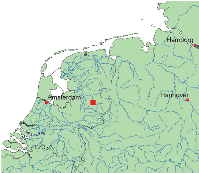
Fig. 3 | The location of the 5km-Nijverdalen section of the river Regge (red square): Sample level 1.