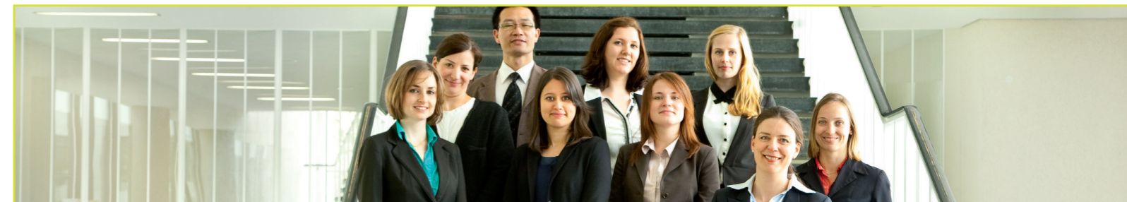
The NFG Research Group