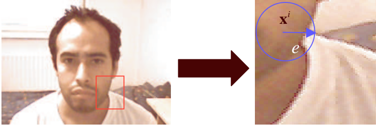
Figure 2: Configuration of the density of the particles, centered in \mathbf{x}^i dependent of the distance e .