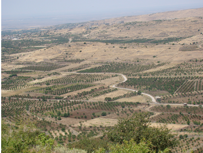
Fig. 3 | General view of the landscape of the study area to the east and southeast of Qanawat. The straight Roman road and the organization of fields on both its sides are clear, besides the terraces and the boundaries of fields running down the abandoned slopes (Photo by the author).

Historic buildings, which are ruinous in this region, make a fundamental contribution to the character of the present-day landscape. The structures situated on farmland can range in date and type from ruined preprovincial villages and fortified hamlets to Byzantine monasteries. In some landscapes, such as the hills to the east and southeast of Qanawat, the ancient hamlets called “khirbets” are numerous and dominate the landscape, some have been visited and described by Butler, e.g. Khirbet al-Khissin that he called “ Town ”. 12 In other areas, their contribution is more subtle but still important in establishing local identity and sense of place. They provide unparalleled evidence, through their siting in the vicinity of villages or in the open countryside, for the long history of settlement in the Jabal al-‘Arab landscape and, through their scale, use of materials and layout, they illustrate the homogeneity of local and regional aspects concerning geology and building tradition. Here, villages are often still surrounded by surviving patterns of ancient field boundaries. 13 The regular pattern of stone walls belongs to an enclosure landscape.