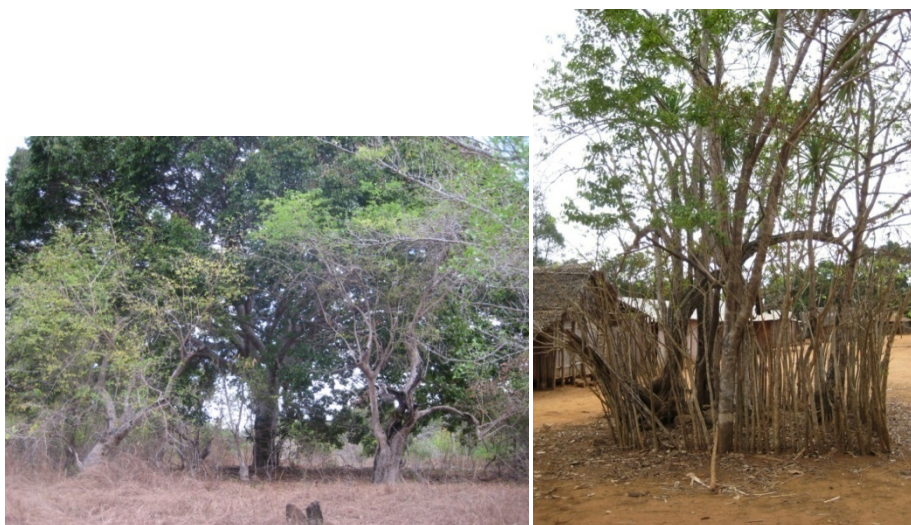
Figure 2: Sacred tree with stones in front that need to be touched before entering (picture to the left); sacred tree with fence in the village (picture to the right)

The issue of spiritual natural values is very complex and difficult to understand for non-Malagasy people. In interviews people were reluctant to talk about spirits that are in relation with natural values. However, it was evident that sacred trees can be found in many villages. They are surrounded by fences and people are not allowed to touch (see Figure 2). Another sacred tree near a village was for example “secured by” a stone, if one wants to approach the tree he/she has to touch the stone before approaching the tree and the same applies when leaving (see also Figure 2). To some extent the power of these sacred objects is considered as inherent value by Malagasy people. Further explanations are presented in the following section.