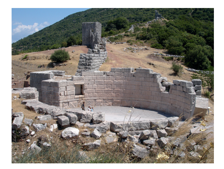
Fig. 2 | Messene city wall, Arcadian Gate with a section running toward the east (view from west).

If we take up the question: Which corpuses of knowledge are effective in demarcating, constructing, and commemorating borders? In the context of city walls, then emerging to begin with is the pragmatic level of artisanal knowledge that is related to the erection of fortifications. Manifested in the precise construction technique of walls and towers in the case of the town walls of Messene (Figs. 1 and 2), investigated by Silke Müth, is knowledge about the construction of assault machinery (or: offensive machinery), of the fortification technology used to resist sieges, as well as concerning the optimal topographical trace of fortifications (on the interplay between poliorcetic and fortification technology, see MARSDEN 1969–71; GARLAN 1974; OBER 1987, 569–604). It is also manifested,