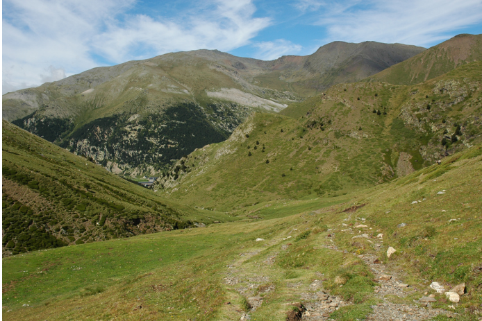
Fig. 2 | High altitude pastures in Puigmal massif (2910m) (Nuria valley, Eastern Pyrenees).

The Roman landscape occupation probably involved a complementary exploitation of natural resources in north-eastern Catalonia. A certain specialization of resources by geographic areas is attested, focused on agriculture and livestock in the littoral plain and mining in high mountain areas. Later, during Late Antiquity (6th–7th AD), mountain and littoral resource exploitation diversified in the context of a more self-sufficient economy. In this sense, the development of metallurgical activities is now documented in the littoral plain, while livestock expanded in the high mountain Pyrenees.