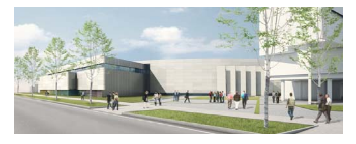
Fig. 1. The EMIL infrastructure at the BESSY II storage ring. For details and current status of the construction see <u>http://www.helmholtz-berlin.de/projects/emil/</u>.

EMIL 's technical specifications are pushing the limits of synchrotron-based X-ray analysis. The EMIL beamlines, to be commissioned in 2015, will provide a photon flux of up to 3 \times 10^{13} photons/s/0.1A/0.1%BW and a resolution E/\Delta E > 10,000 . Spot sizes of 45 \times 10 \ \mu\text{m}^2 and 120 \ x \ 10 \ \mu\text{m}^2 for soft and hard X-ray energies, respectively, will be realized (for details see [1]).