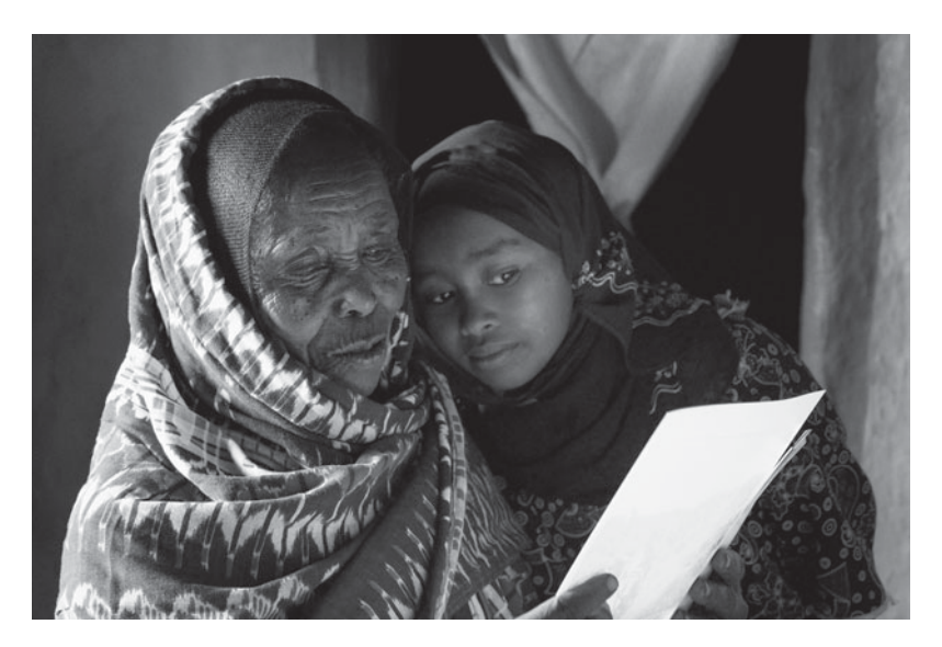
FIGURE 1 (Fig. 4.5 in the book) Bokayo and young relative looking at a photograph by Paul Baxter taken in the 1950s, Marsabit, July 2010

agency both in the process of image making and in the production of meaning. For example, Neil Carrier and Kimo Quaintance returned and discussed with relatives and descendants the photographs taken of individuals in northern Kenya during the 1950s. In this way, images originally taken to represent an 'exotic' culture were reinvested with history and biography, offering the collection another layer of meaning as well as a social after-life.