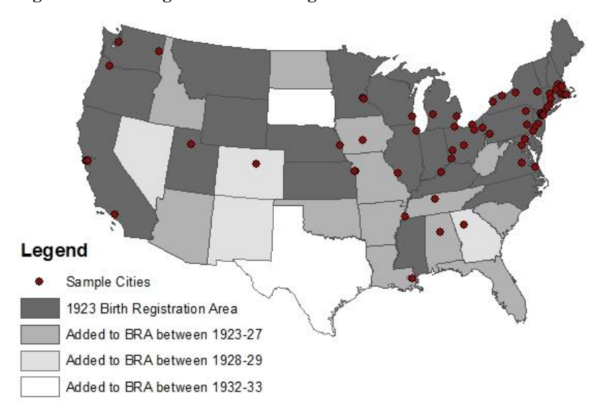
Figure 2: Changes in the Birth Registration Area from 1923

participate. Figure 3 plots the scaled GFR individually for four different BRA cities, as well as its average level in each year for all 64 sample cities. With the exception of a brief increase between 1923 and 1924, average fertility across the cities fell consistently between 1923 and 1932. The rates of decline, however, varied among cities. The four cities whose fertility levels are represented in Figure 3 are Fall River, MA, Camden, NJ, Los Angeles, CA, and San Francisco, CA, chosen for their differing fertility trajectories. Replacement level fertility is estimated to be approximately 2.3 during this period of time, and is indicated by the shaded area.