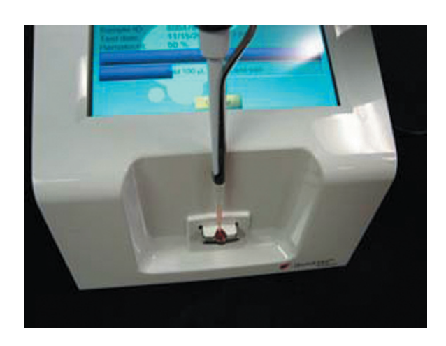
Figure 2. The diluted blood sample is added to the cartridge preheated in the analyzer to 37°C.

(cell line 5B6) in the gel matrix. The gel matrix of the control column does not contain any reagents and serves as the negative control (autoagglutination control). For preparation of a 5% RBC suspension, 500 µl of diluent<sup>1</sup> was mixed with 25 µl of packed RBCs. The RBC suspension was incubated for 10 min at room temperature. Thereafter, 12.5 µl of the RBC suspension was added to the DEA 1.1 column and to the control column. The card was centrifuged at 80 \times g for 10 min in a centrifuge provided by the company.<sup>g</sup> The cards were visually interpreted as follows: (0) negative, when all RBCs are at the bottom of the tube; 1+, when very few RBC agglutinates are dispersed in the lower part of the gel, with most RBCs at the bottom of the tube; 2+, when all RBCs are agglutinated and dispersed in the gel; 3+, when some RBC agglutinates are dispersed in the upper part of the gel and most of the RBCs formed a red line on the surface of the gel;