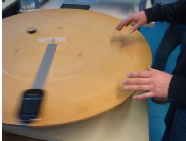
Figure 3: Inquiry into the centripetal force

implementation, assessment and evaluation of the experiment. To determine who is available online at a given moment, interfaces to common social Networks like Twitter, Facebook or Google+ will be integrated. Likewise, collaborations between classes from different countries or regions can be realized in the form of joint research projects in which measurements that were made in local environments can be collected and evaluated.