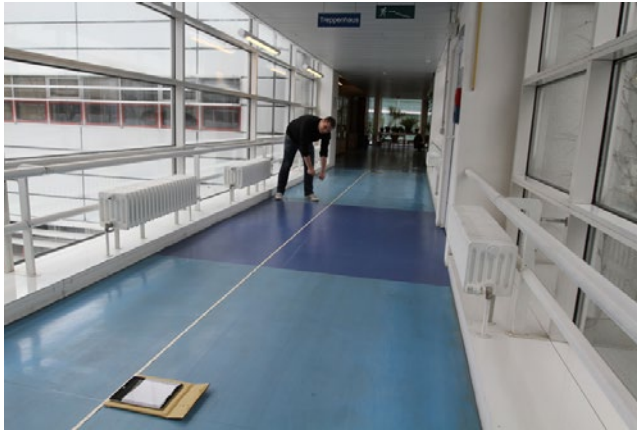
Figure 2: Measuring the speed of sound

With a pair of claves a synchronization sound was generated exactly in the middle of the 5-meter mark. Shortly afterwards, the actual measurement click was generated (spatially behind the iPads). Both clicks were recorded by the two iPads. The high resolution of the used sound editor allowed us to display the exact time interval between the two clicks. From the time difference between the two measuring points, the learner was able to determine the speed of sound (speed = distance / time) rather precisely. Several scenarios to promote active learning are documented on Blog Mediendidaktik (URL below).