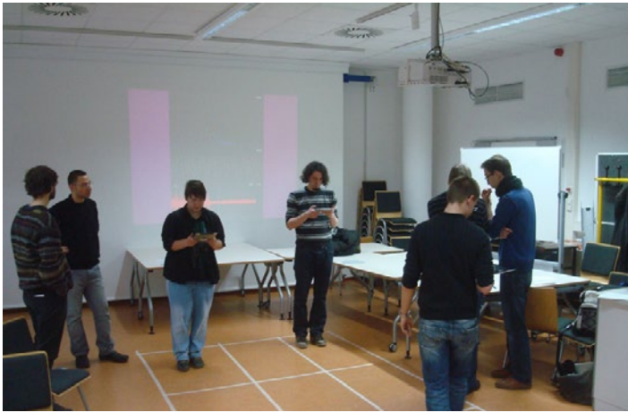
Figure. 1: Acoustic measuring in the classroom