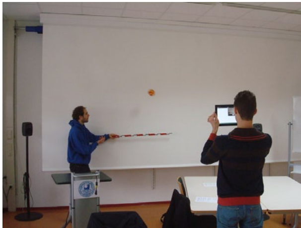
Figure 4: Video-analysis with the tet.folio

implementation, assessment and evaluation of the experiment. To determine who is available online at a given moment, interfaces to common social Networks like Twitter, Facebook or Google+ will be integrated. Likewise, collaborations between classes from different countries or regions can be realized in the form of joint research projects in which measurements that were made in local environments can be collected and evaluated.