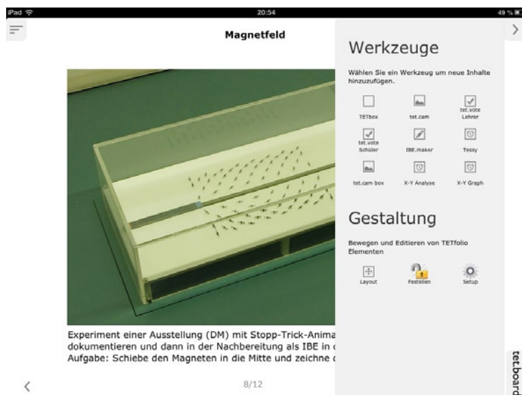
Figure 5: tet.folio page on a computer screen