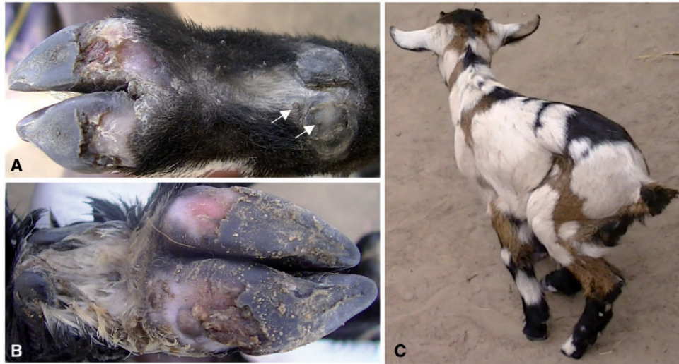
Fig. 1. Tungiasis in Case 1. Stage III lesions on coronary band of the dew claw (arrows) and bilateral hoof wall loss of the front limb (A). Dead sand fleas, necrosis, and loss of hoof wall tissues of the hind leg (B). Infected goat kid with lameness (C).

was necrotic and had peeled off from the sole to expose the underlying soft tissue (Fig. 1B).