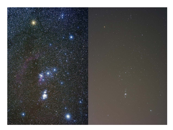
Figure 1 | Skyglow reduces the visibility of celestial objects for both the human eye and consumer cameras. The GLOBE at Night project works by assessing the visibility of stars near constellations like Orion, shown here. This image, entitled "Light pollution: it's not pretty" was produced by Jeremy Stanley and is released under the CC BY 2.0 license (http://commons.wikimedia.org/wiki/File:Light_pollution_It%27s_not_pretty.jpg), access date 18 January 2013.

through both mechanisms (e.g. aerosols). The GLOBE at Night project avoids the two most important factors by limiting the observations to times when the moon is set, and requiring observers to record the cloud cover. The rest of the variables, however, introduce a systematic uncertainty of unknown size into the dataset. In addition to physical phenomena, additional variance is introduced by the observational experience of observers<sup>16</sup>, as well as through mistakes made by participants during the data submission process, such as entering an innacurate location.